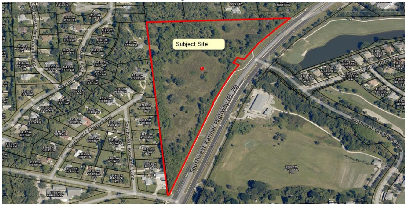
Figure 3: Subject Site with Development Overlay