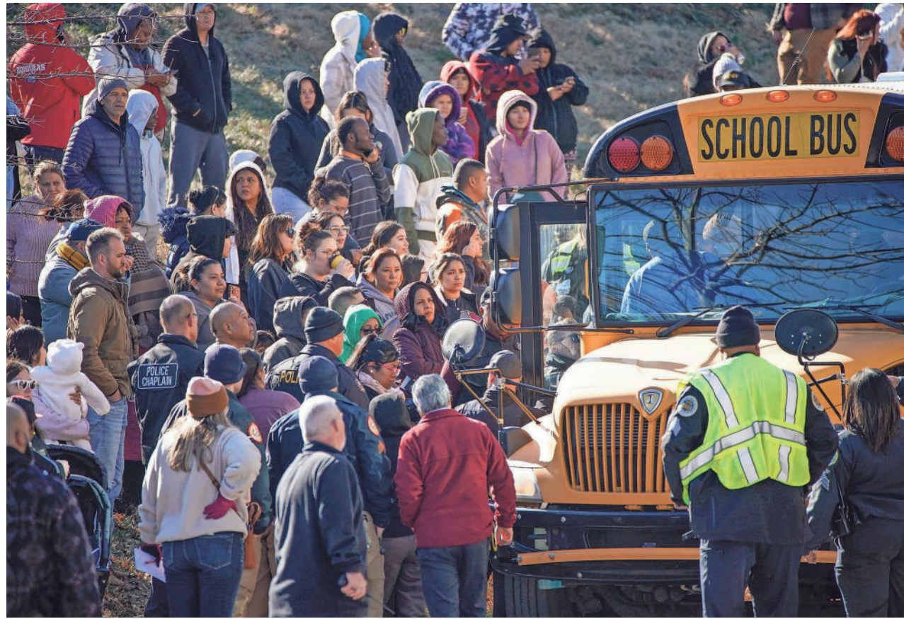
Students from Antioch High School arrive by bus at a reunification center on Wednesday following a shooting at the school in Antioch, Tenn.