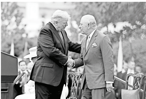
President Donald Trump and King Charles III showed graciousness and warmth during the king's visit to the United States, but it is unlikely to solve any real policy disagreements.