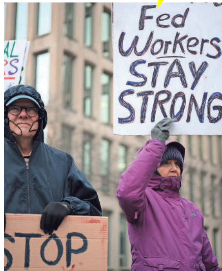
Demonstrators protest the Trump administration's plans to shrink the federal workforce outside the headquarters of the Office of Personnel Management on Wednesday in Washington.

Unions have warned workers considering Trump's offer that there's no guarantee the president can or will stick to it. They've also said the offer lacks basic information about whether they might still be required to work for the government; whether they can get a private-sector job while still being paid by the federal government; and how