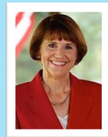
Senator Gayle Harrell District 25