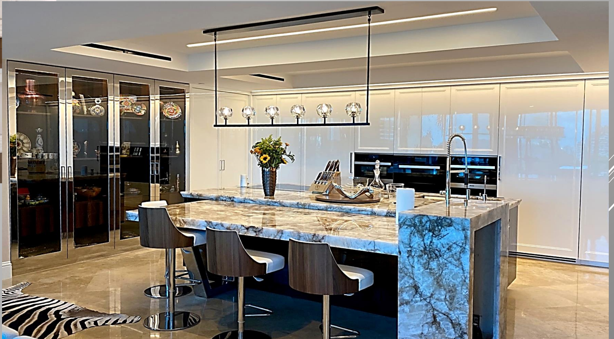
'21: Render vs Reality