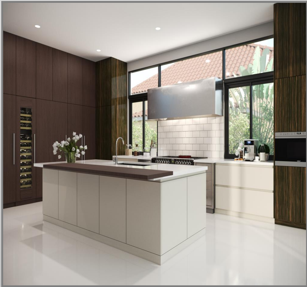
'21: Render vs Reality by Ryan