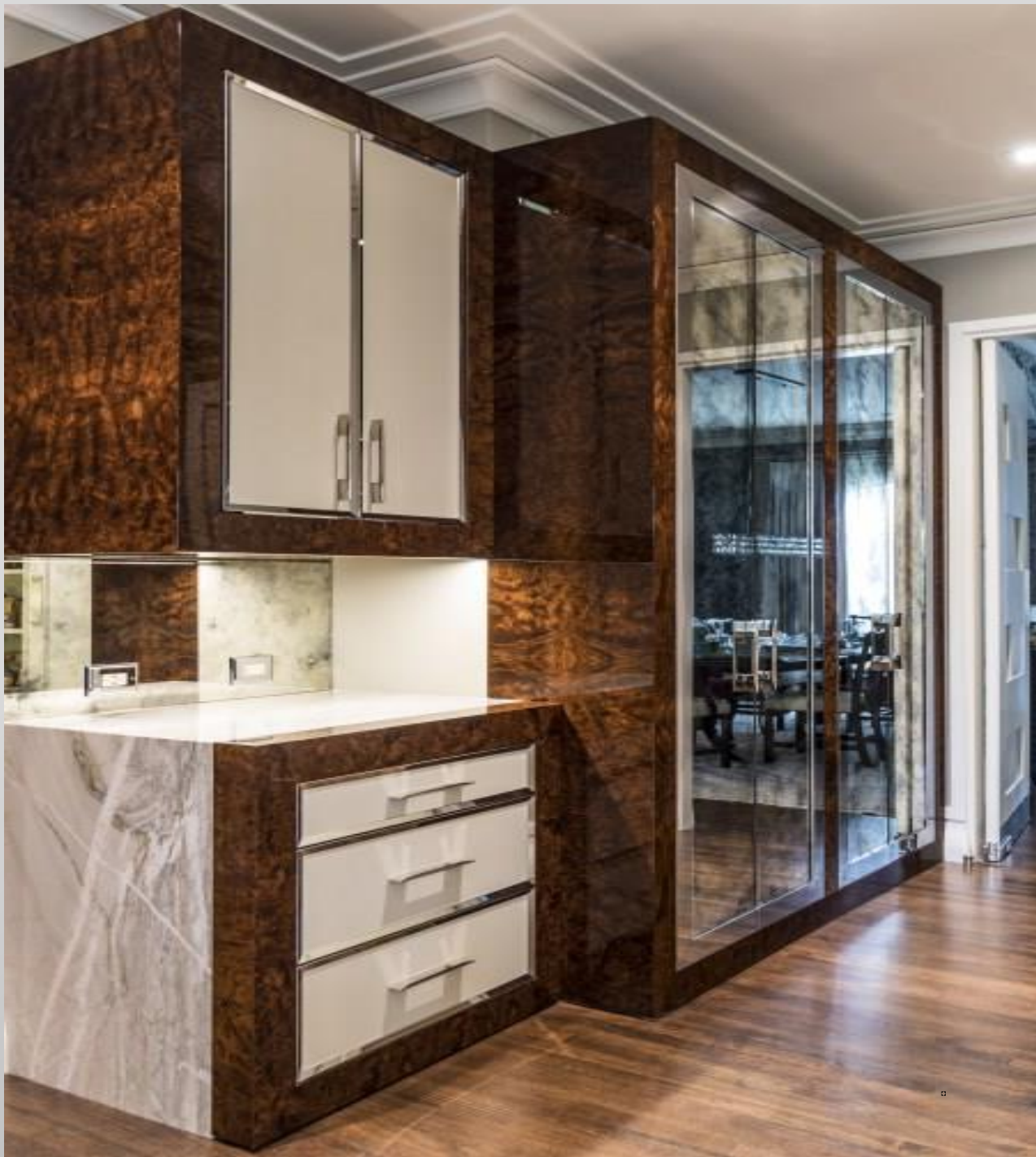
Exotics, private collection