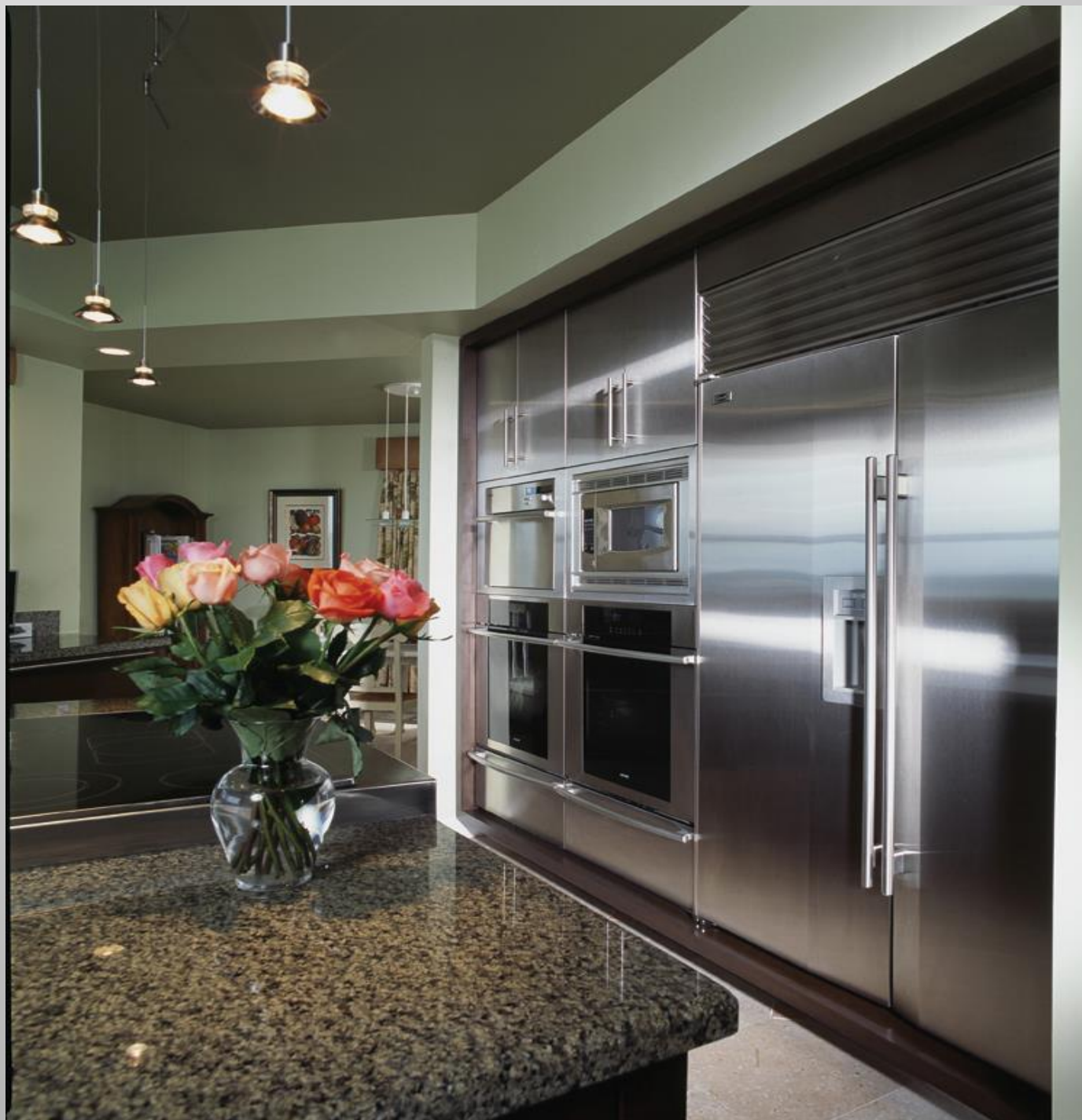
Top 10 Wm Ohs kitchen '10: custom metal work