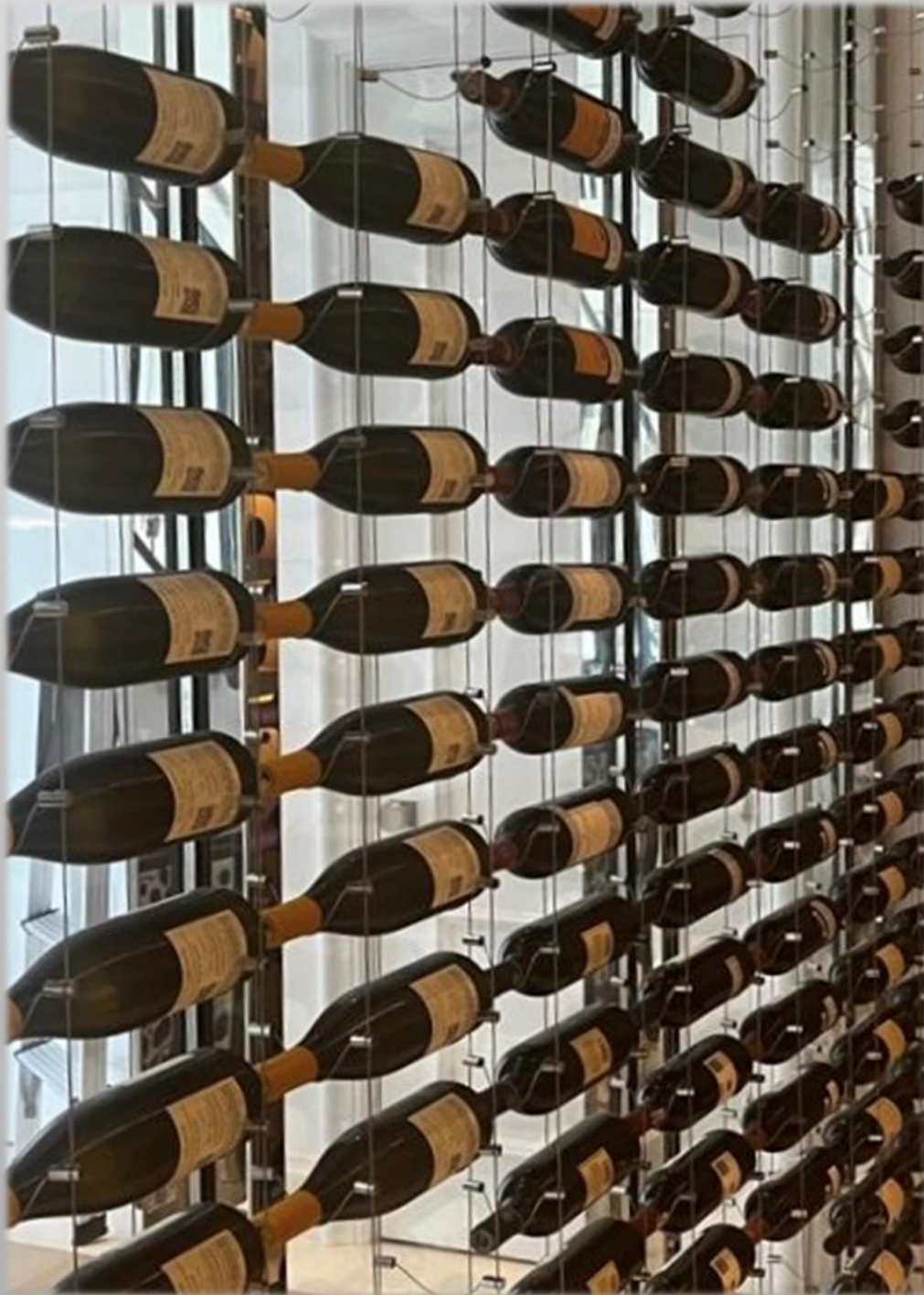
The Kitchen Strand Inc. © 2020