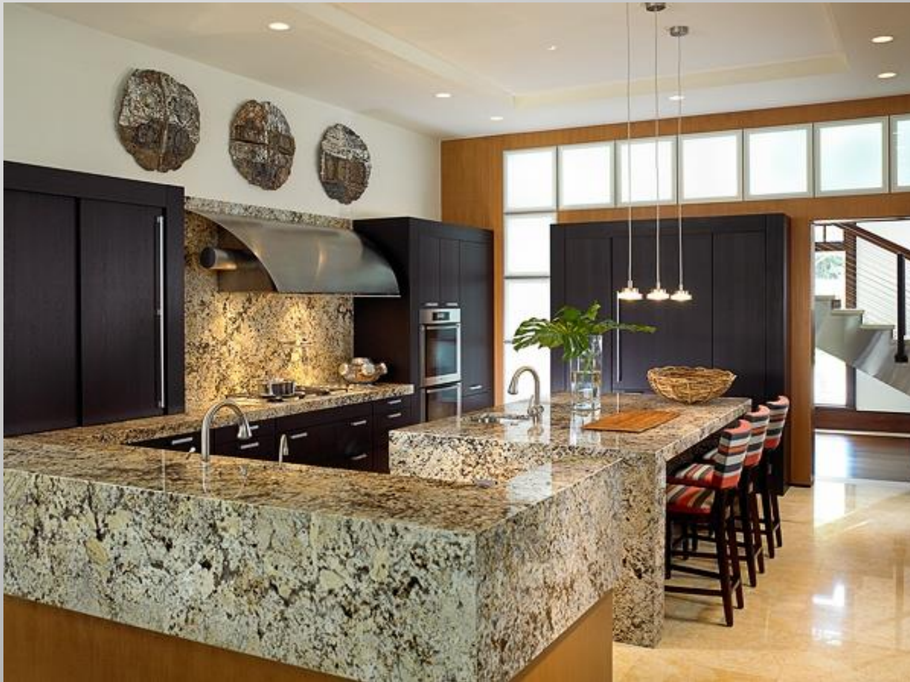
Functional Artworks '06, collaboration sub-zero award