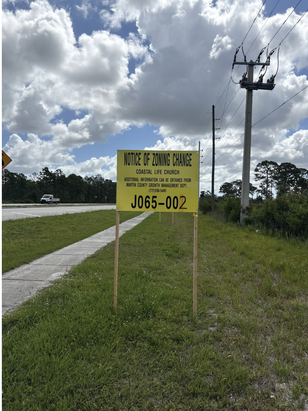
SW Martin Highway Sign Posted 4/2/2026