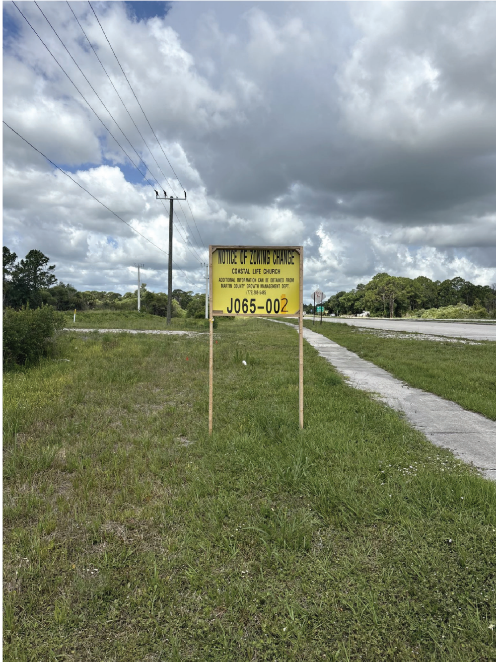
SW Martin Highway Sign Posted 4/2/2026