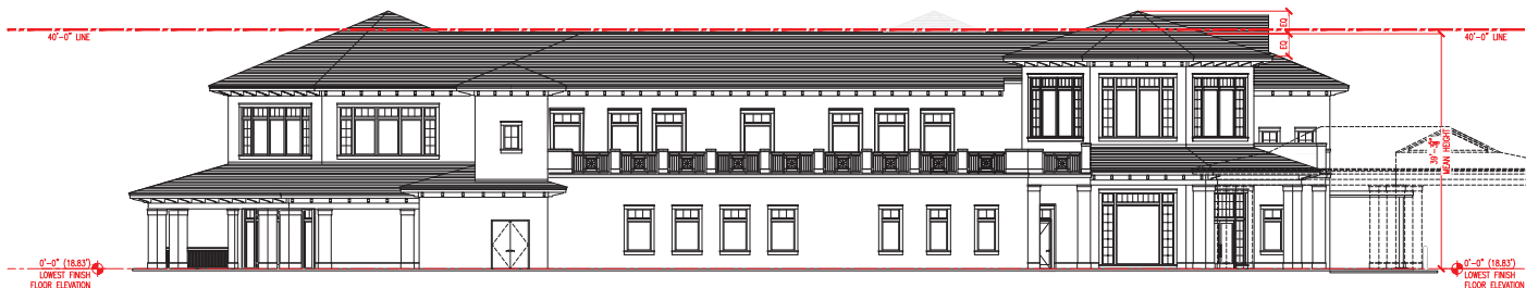
EXTERIOR ELEVATION - WEST VIEW