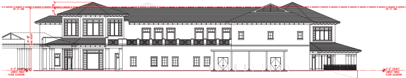
EXTERIOR ELEVATION - NORTH VIEW