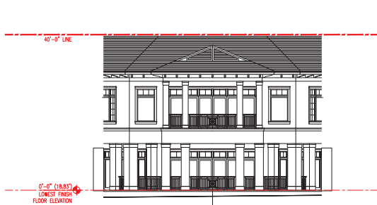
REAR PATIO - FRONT VIEW