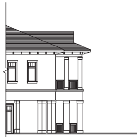
PORTE COCHERE - SIDE VIEW