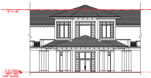
PORTE COCHERE - FRONT VIEW