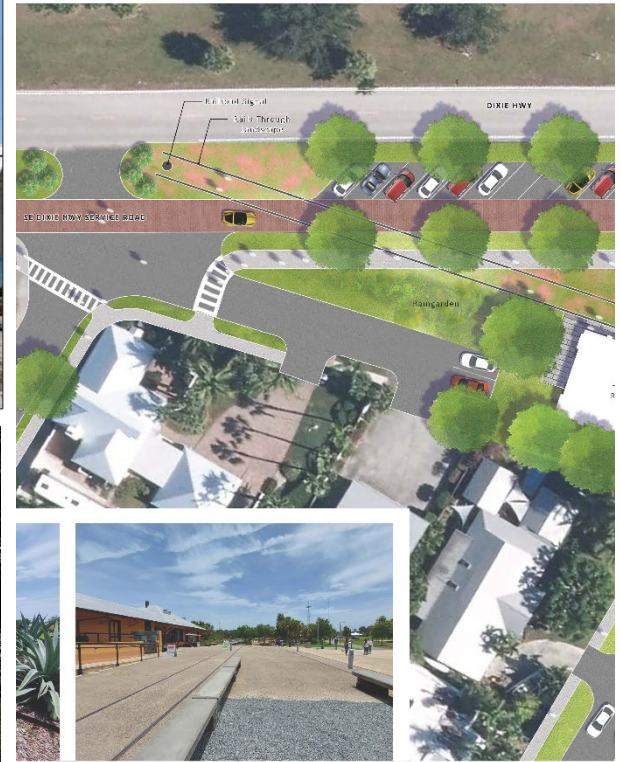
Seaside Sound Downtown Vision in County, FL