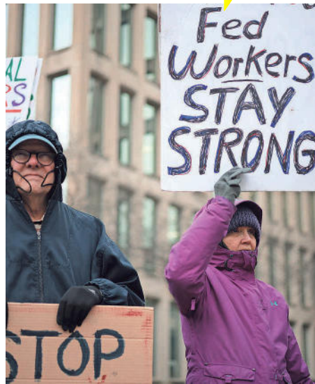
Demonstrators protest the Trump administration's plans to shrink the federal workforce outside the headquarters of the Office of Personnel Management on Wednesday in Washington.

Unions have warned workers considering Trump's offer that there's no guarantee the president can or will stick to it. They've also said the offer lacks basic information about whether they might still be required to work for the government; whether they can get a private-sector job while still being paid by the federal government; and how