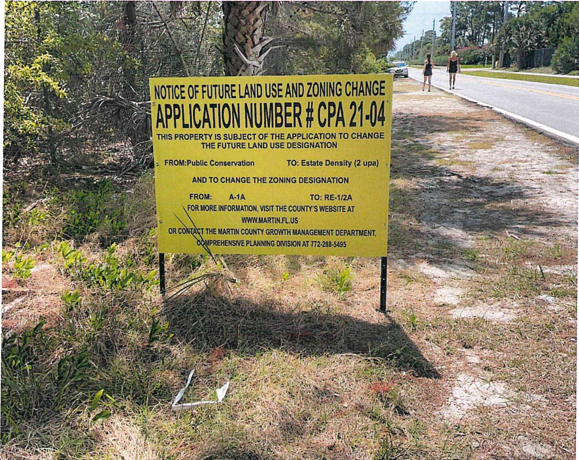
Sign 1 Side 1