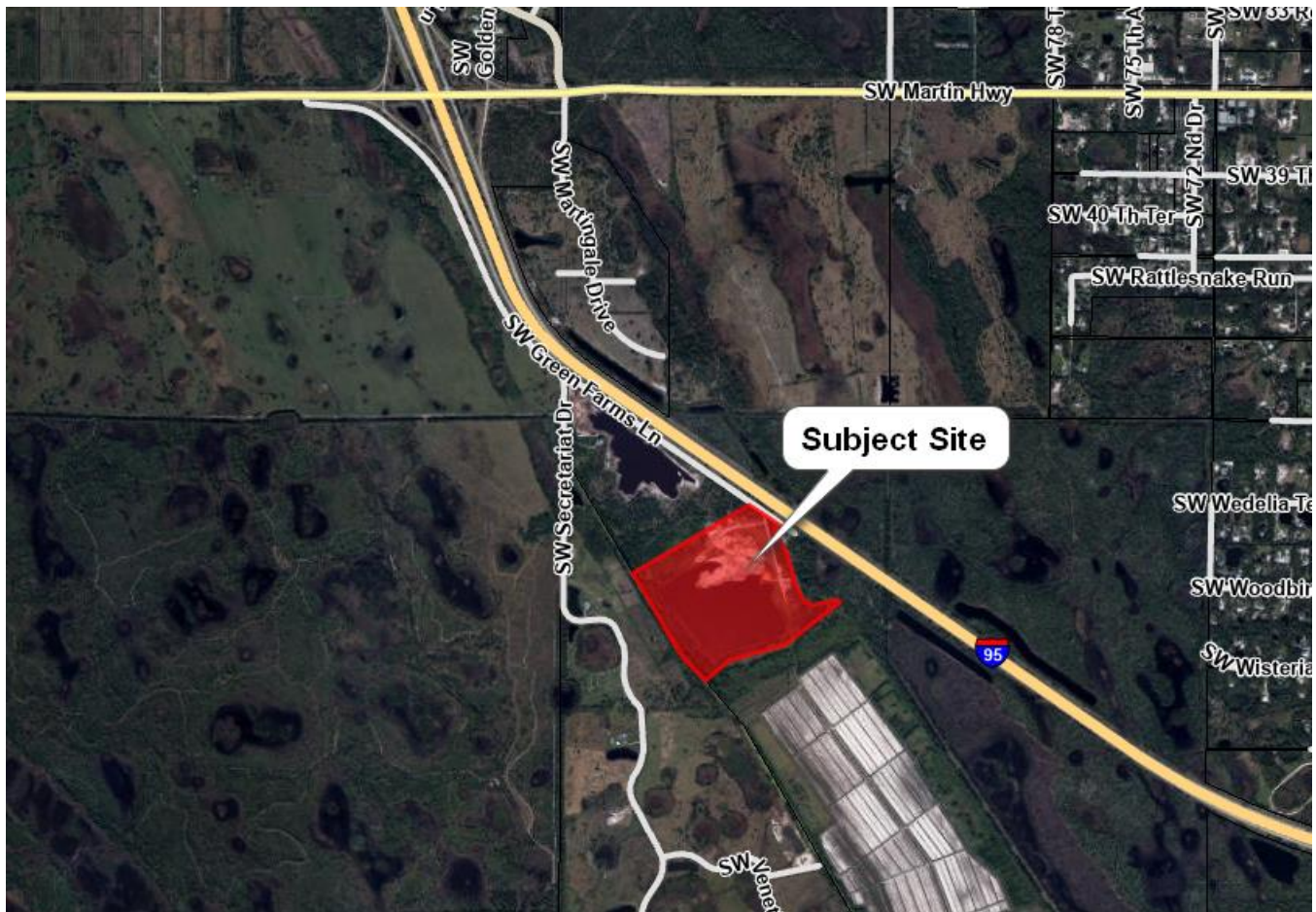
Figure I: Location Map

Parcel number(s) and address: 30-38-40-000-000-00024-0 Existing Zoning: A-2, Agricultural Future Land use: Agricultural Gross area of site: 111.11 Acres