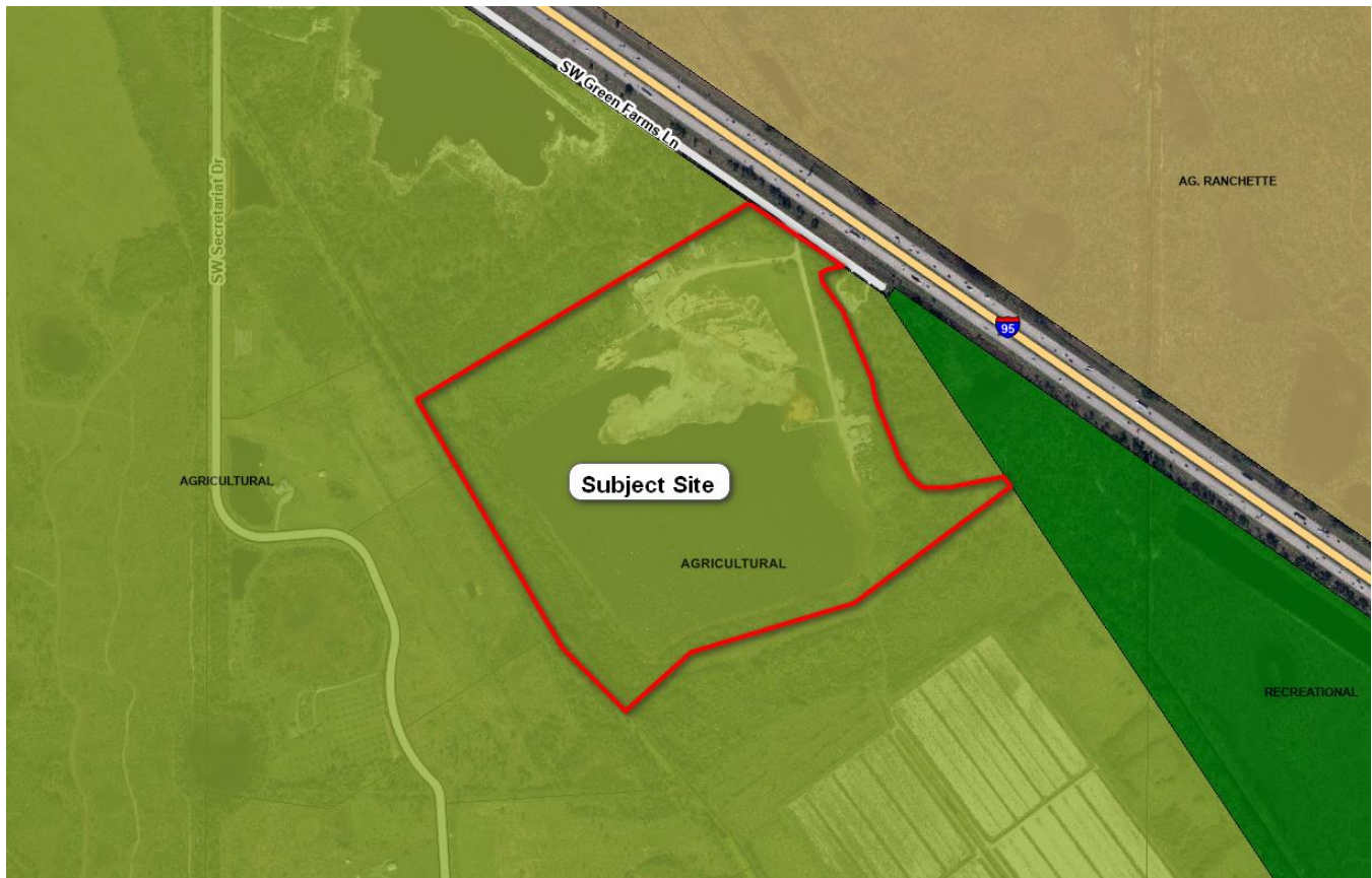
Figure III: Future Land Use Map

Property to the East: Recreational; Agricultural; AG. Ranchette Property to the North: Agricultural; AG. Ranchette Property to the West: Agricultural Property to the South: Agricultural