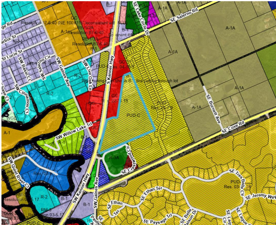
Figure 3 Zoning Map

Zoning district designations of abutting properties: