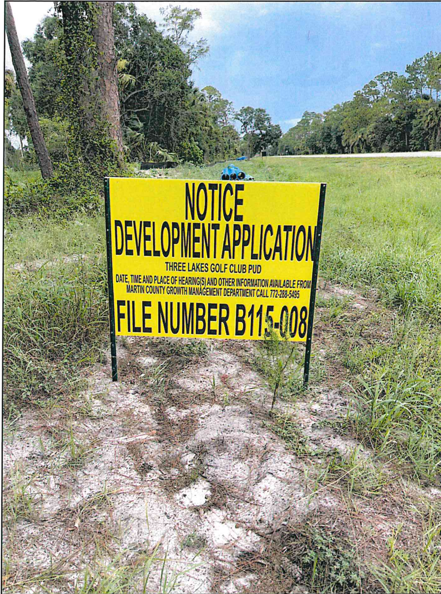
SW Kanner Highway- West Side