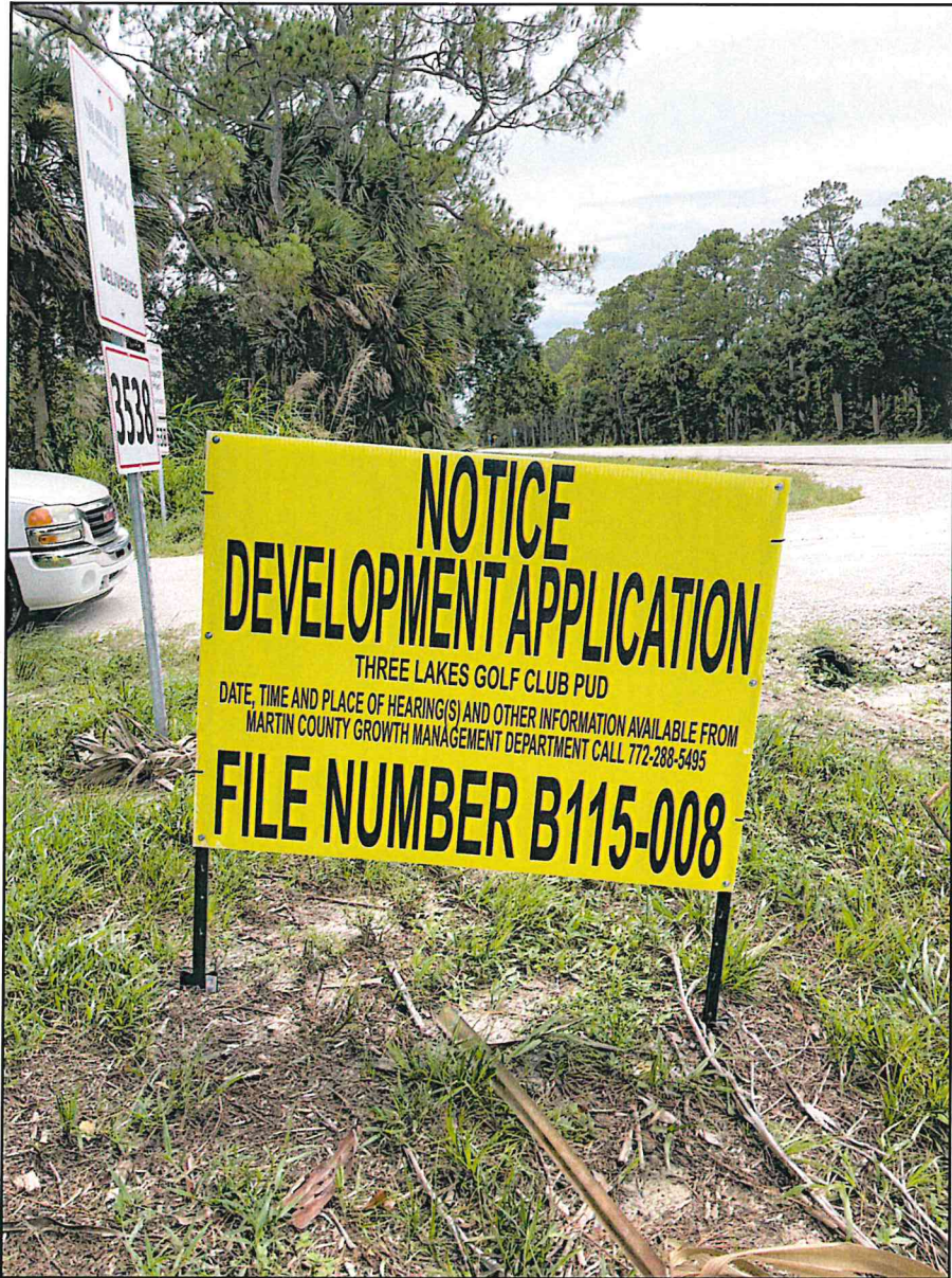
SW Kanner Highway- East Side