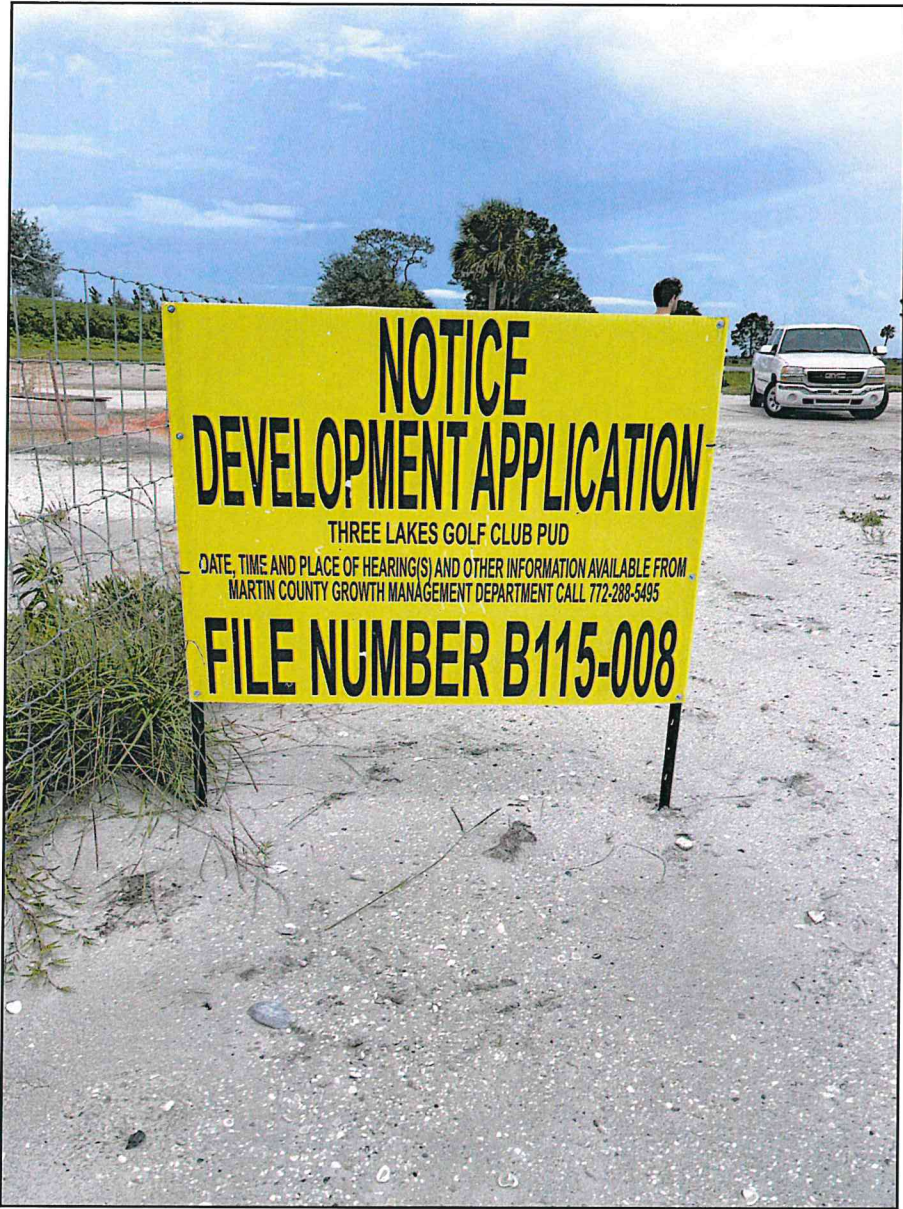
SW Bridge Road