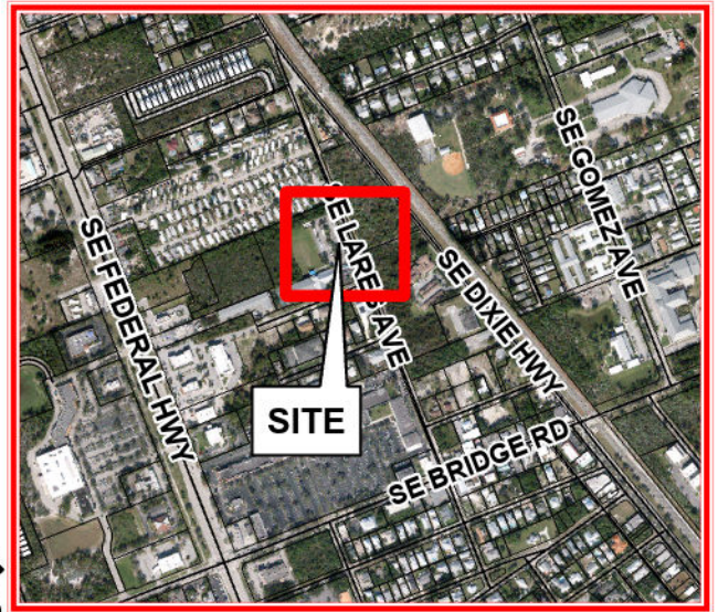
NOT TO SCALE 2025 AERIAL