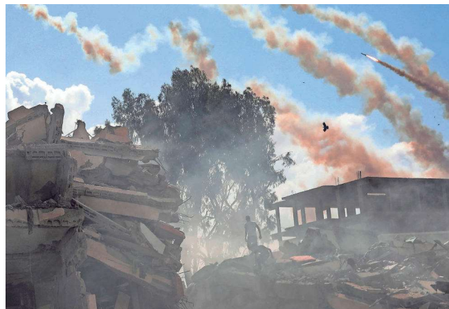
Rockets are fired from the Gaza Strip toward Israel over destroyed buildings following Israeli airstrikes on Gaza City, central Gaza Strip, Thursday.

A U.S. cargo plane arrived in Israel carrying the initial shipment of armored vehicles designated to replace those damaged during the war, the Israel Ministry of Defense said Thursday. Armored ambulances,