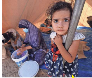
A girl stands inside one of the tents set up for Palestinians seeking refuge on the ground in the Gaza Strip on Thursday.

More than 1 million people have fled their homes in