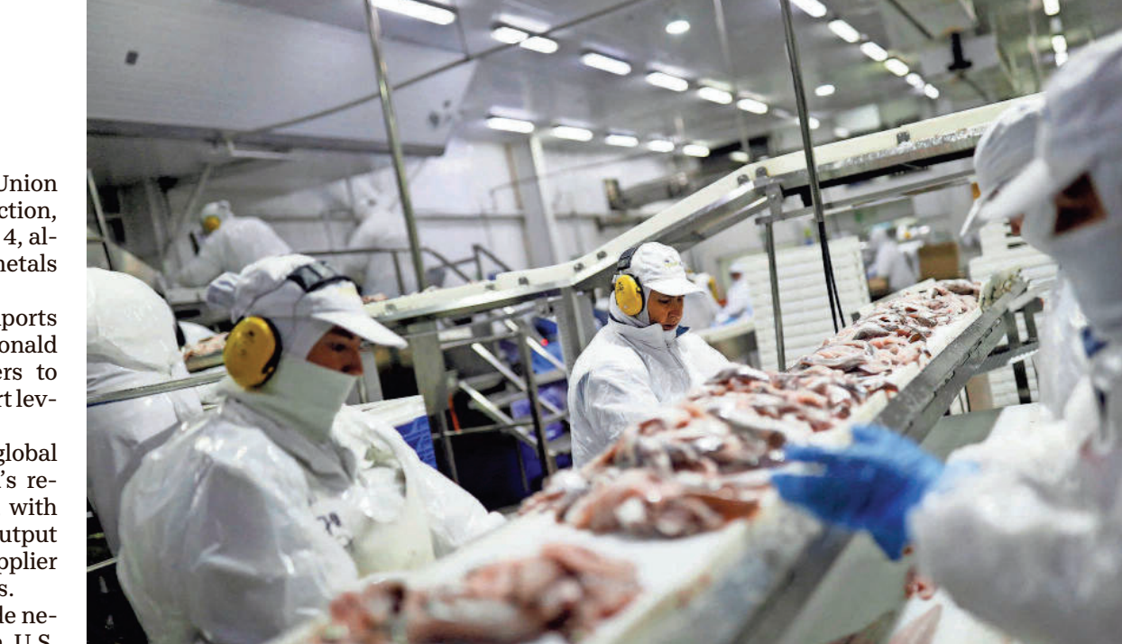
Workers process hake at a fishing company in Talcahuano, Chile, on May 20. The White House expected trading partners to propose deals that might help them avoid President Donald Trump's tariffs by June 4.