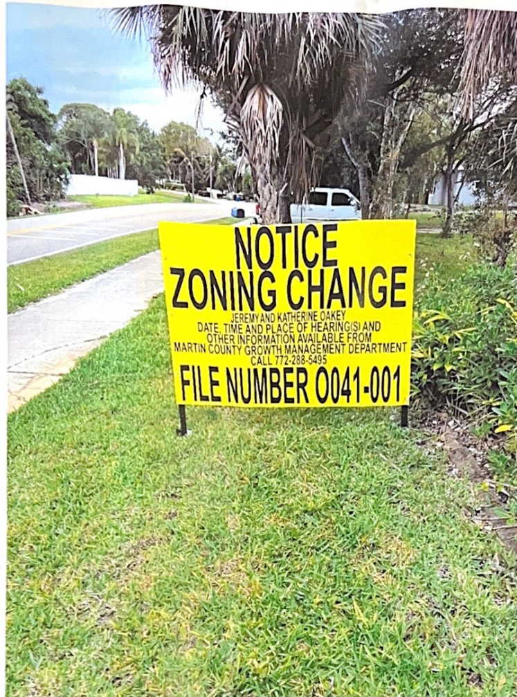
Sign 1 Side 1