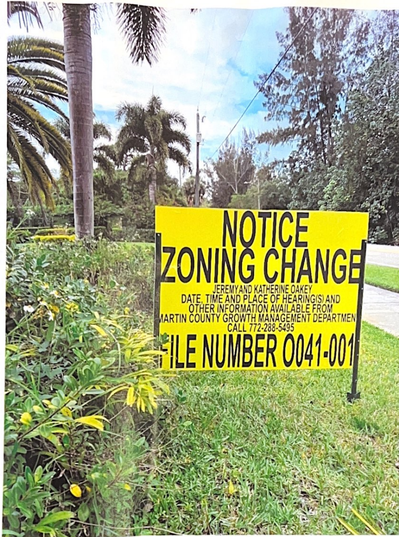
Sign 1 Side 2