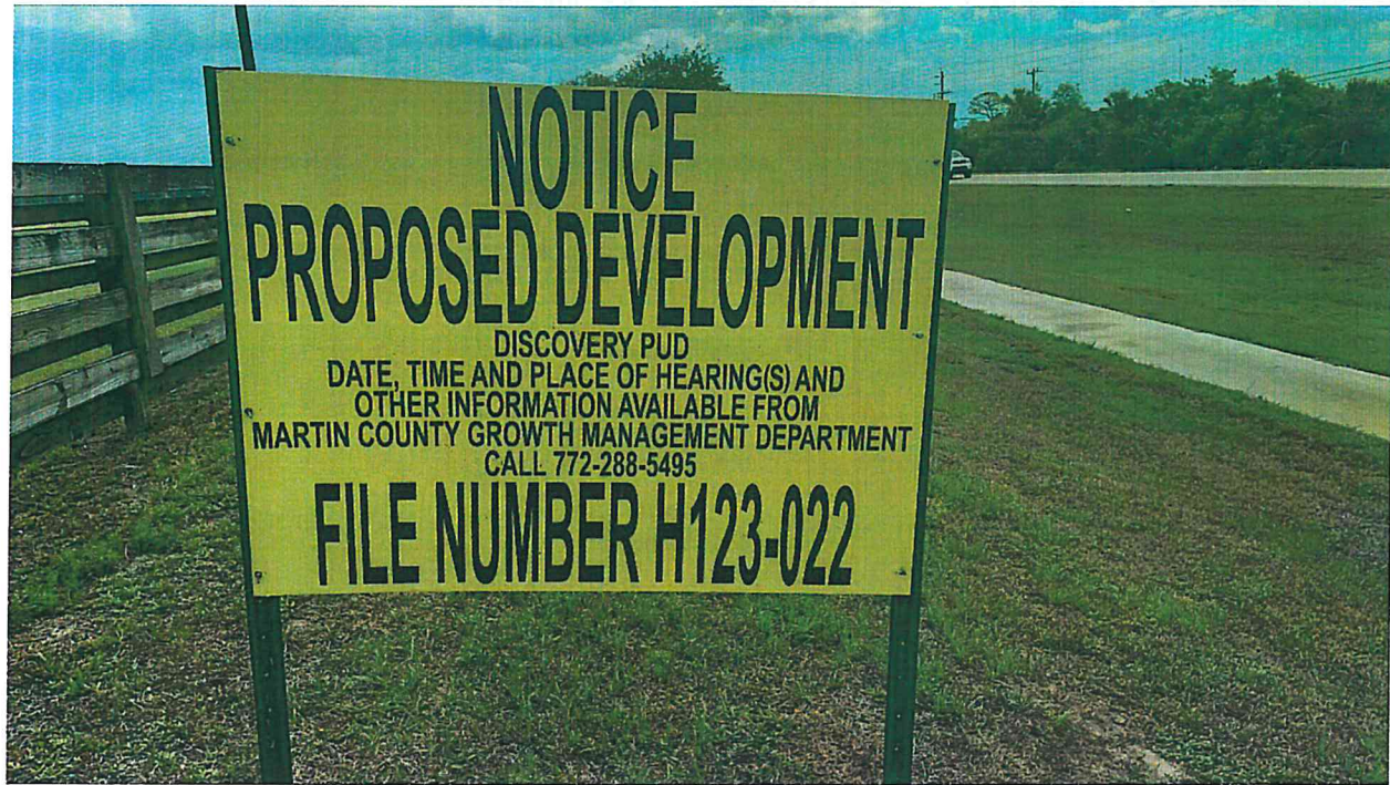
Sign 1 Side 2