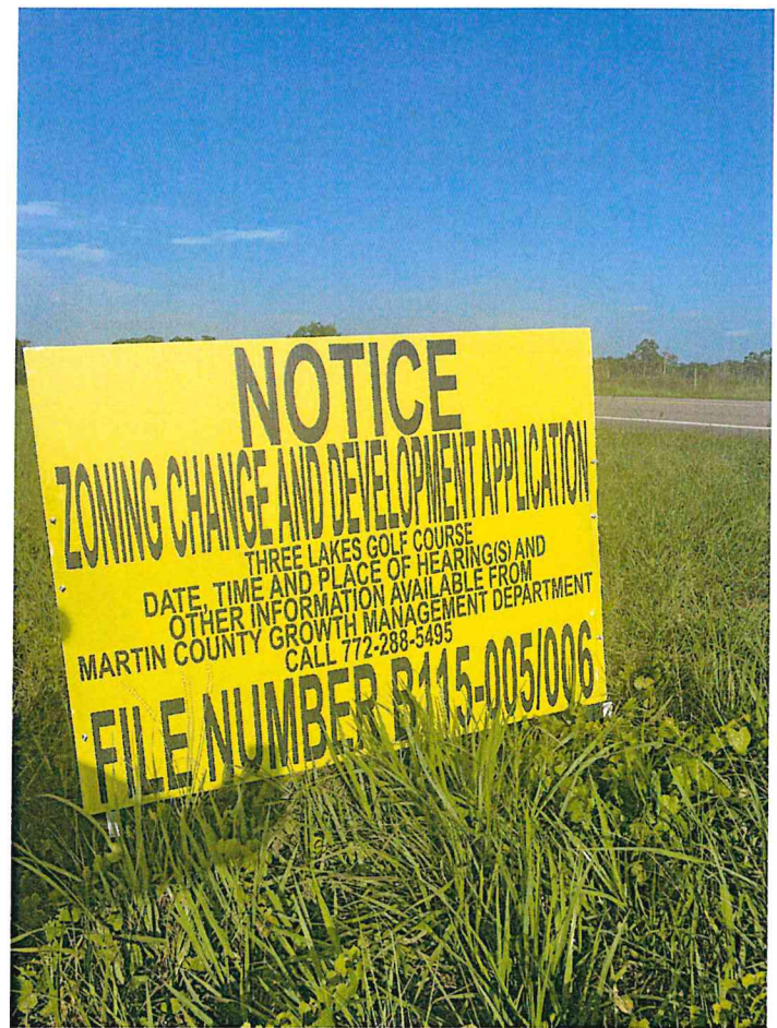
Sign 3- SW Bridge Road