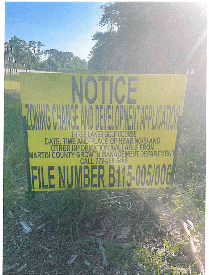
Sign 2- SW Kanner Highway