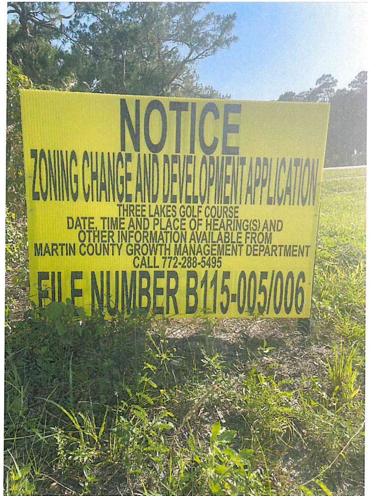
Sign 1- SW Kanner Highway