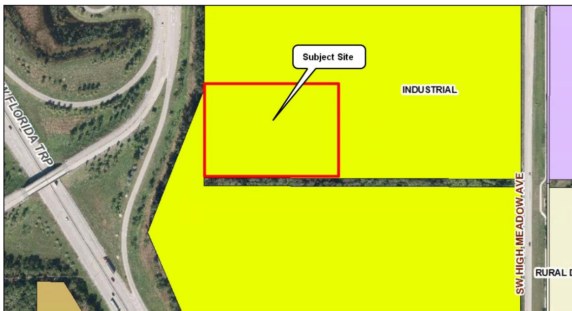
Figure 4: Future Land Use Map (Industrial)

Zoning district designations of abutting properties: