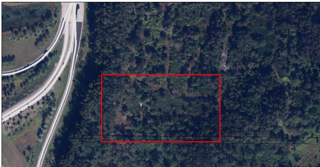
Figure 2: Subject Site 2021 Aerial

Future land use designations of abutting properties: