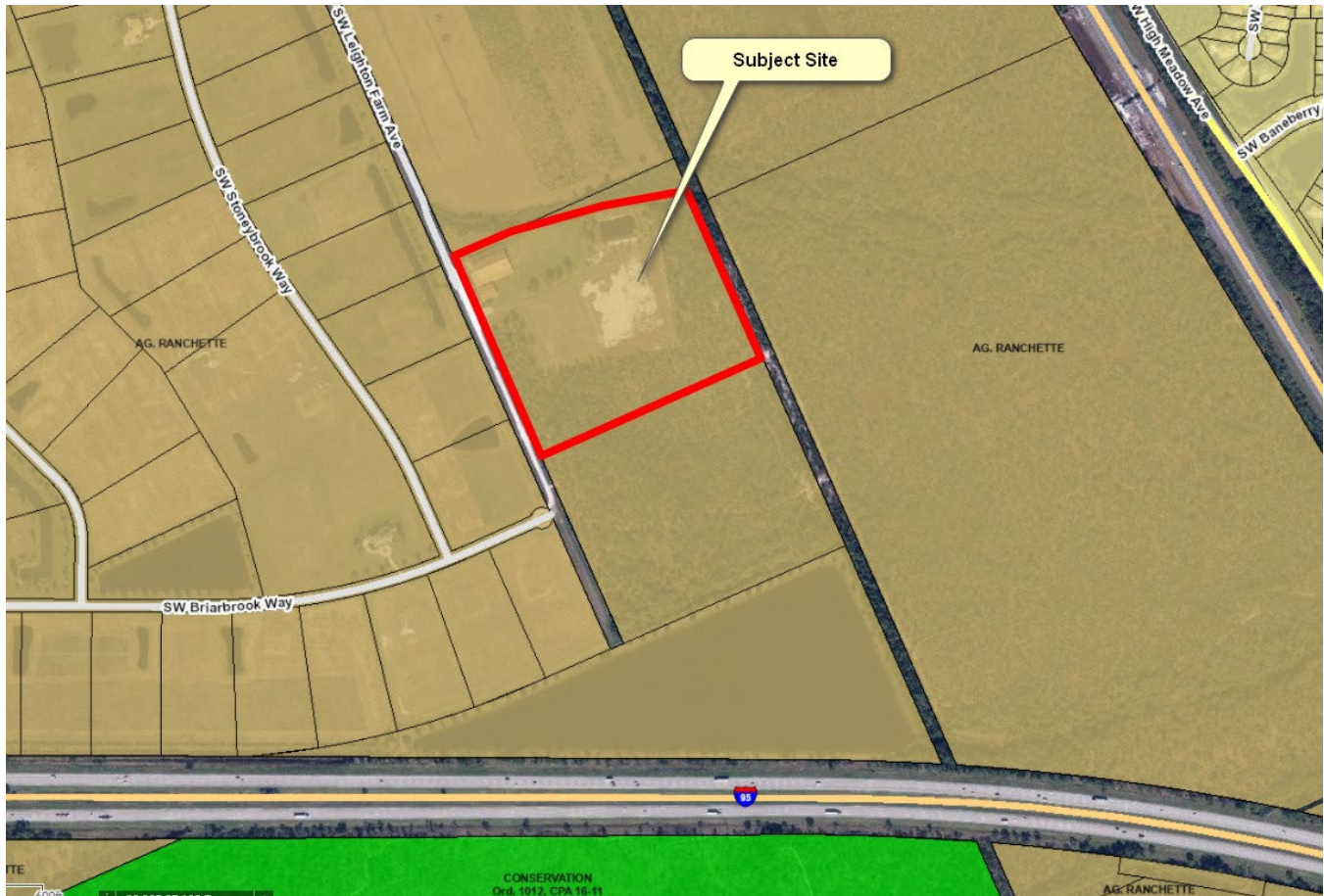
Figure 3: Subject Property Future Land Use

To the north: Agricultural Ranchette To the south: Agricultural Ranchette To the east: Agricultural Ranchette To the west: Agricultural Ranchette