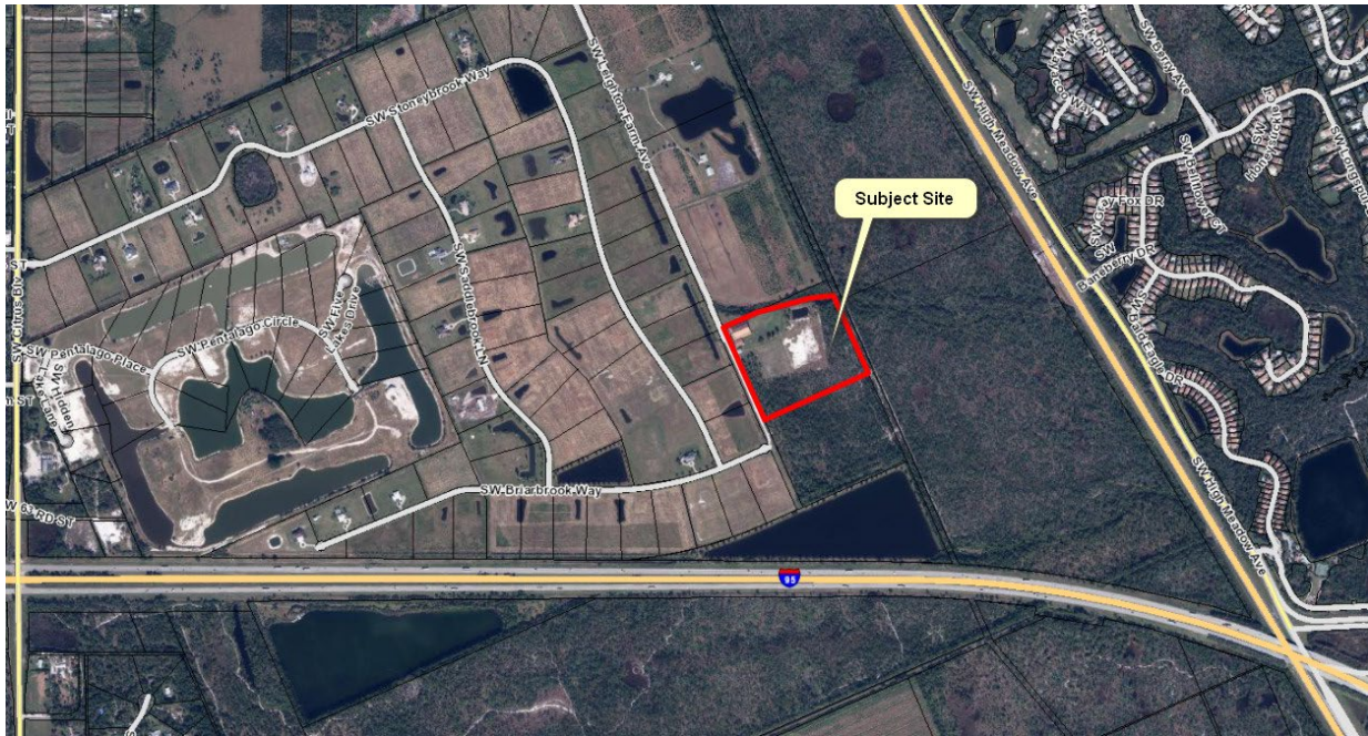
Figure 2: 2021 Aerial (Property Appraiser – Image Date: 12/02/2021)