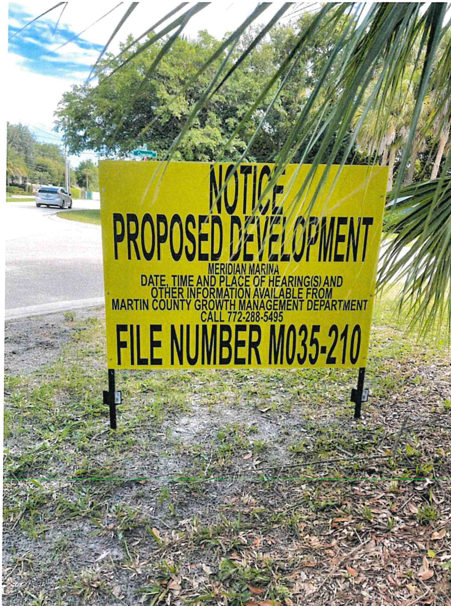
Sign 1 Side 1