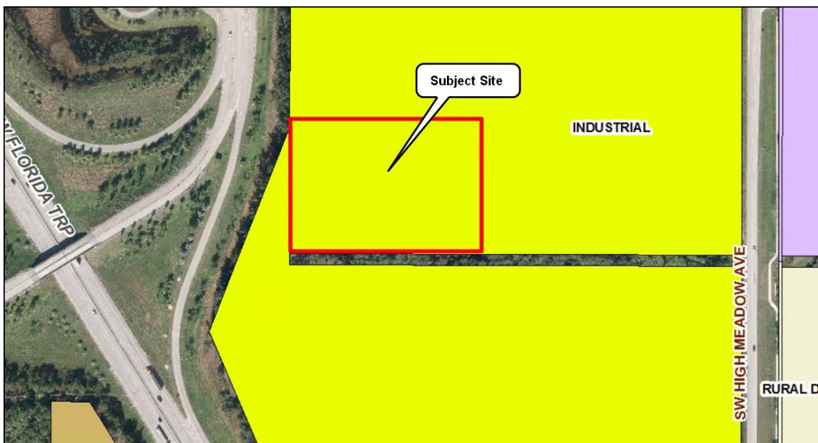
Figure 4: Future Land Use Map (Industrial)

Zoning district designations of abutting properties: