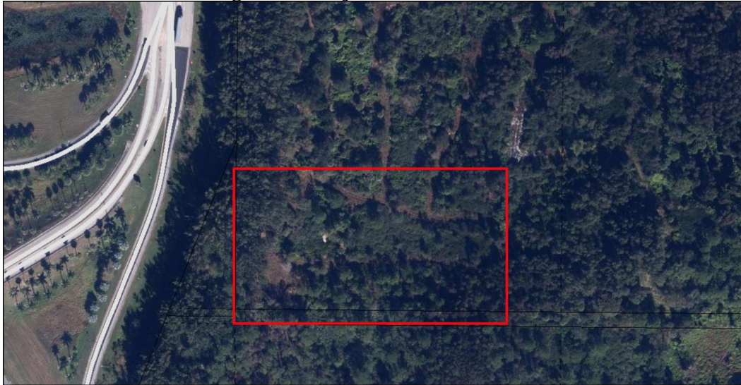
Figure 2: Subject Site 2021 Aerial

Future land use designations of abutting properties: