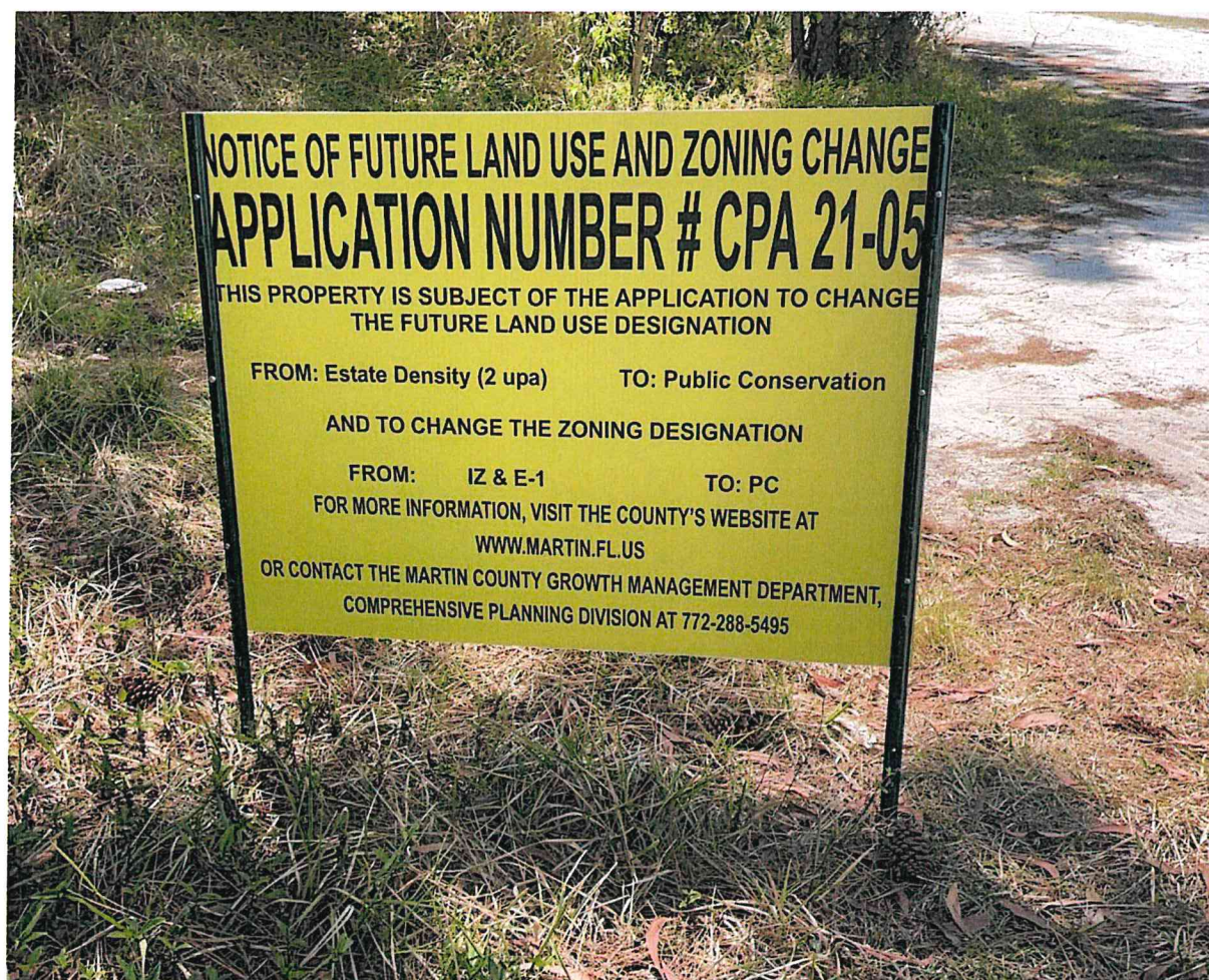
Sign 1 Side 1