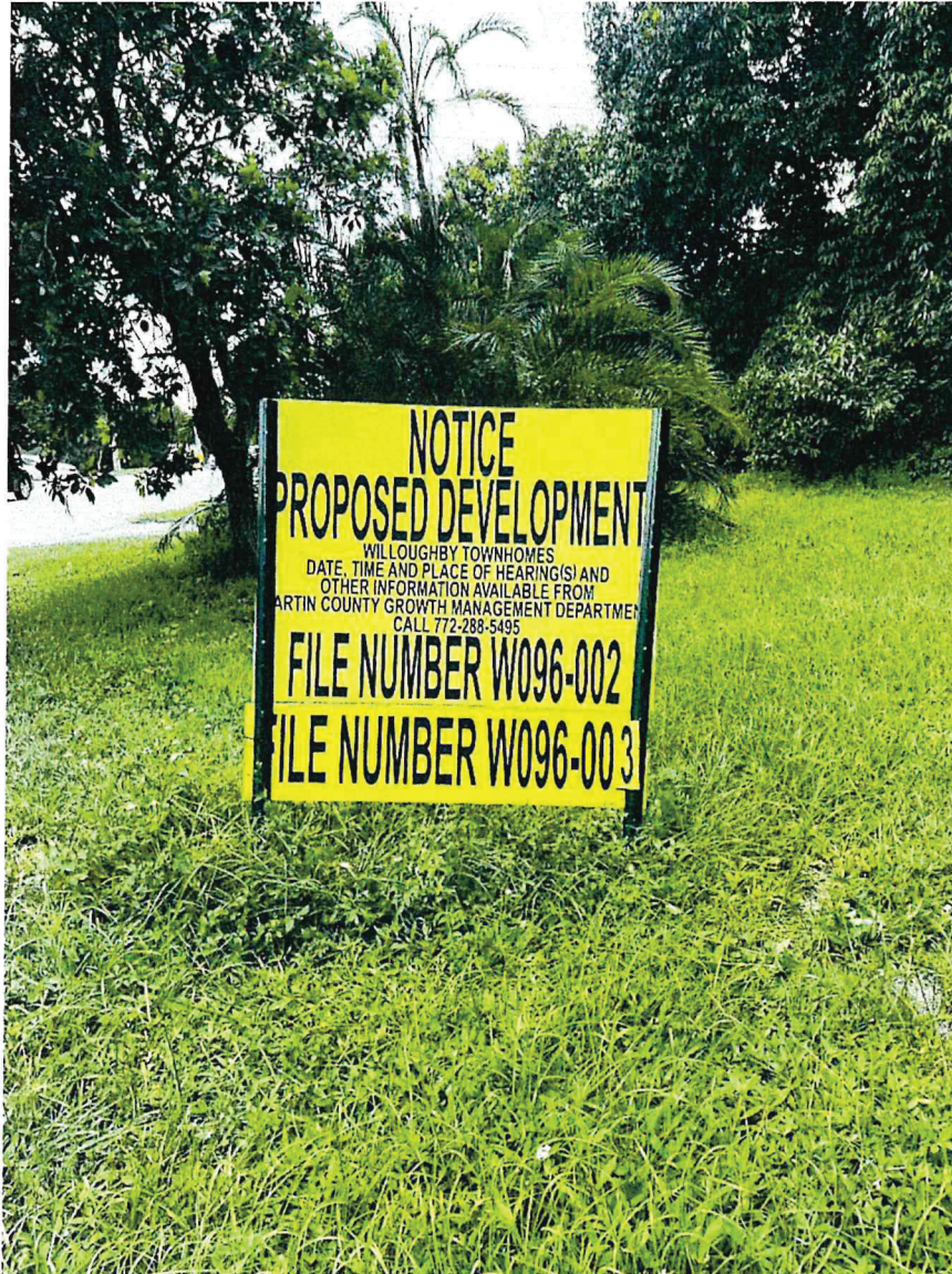
Side Two Sign on Salerno Road Photograph