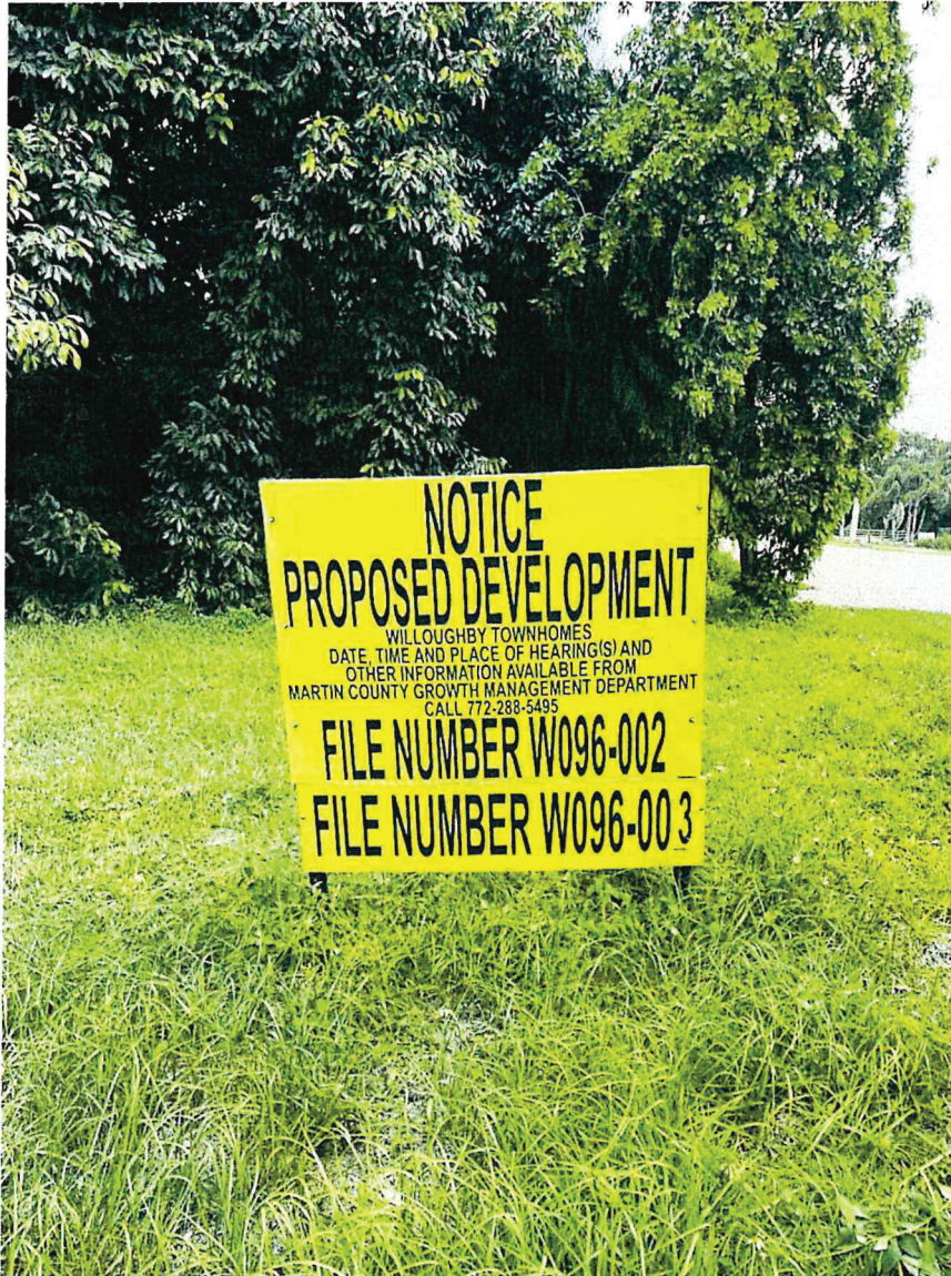
Side One Sign on Salerno Road Photograph