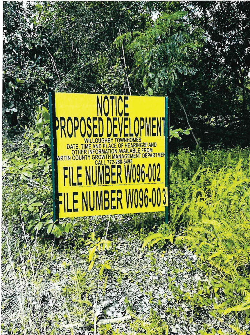
Side Two Sign on Willoughby Blvd.