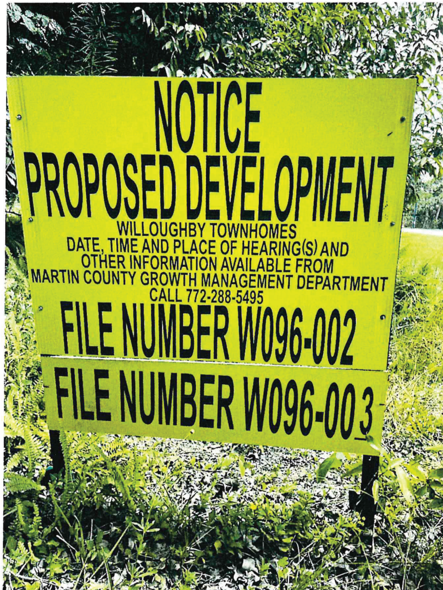
Side One Sign on Willoughby Blvd.