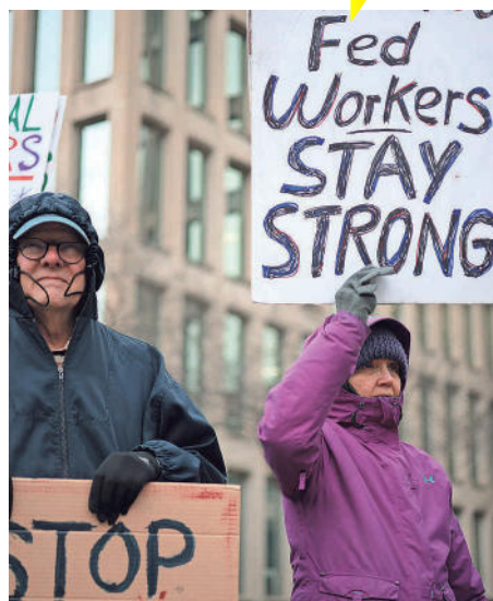
Demonstrators protest the Trump administration's plans to shrink the federal workforce outside the headquarters of the Office of Personnel Management on Wednesday in Washington.

Unions have warned workers considering Trump's offer that there's no guarantee the president can or will stick to it. They've also said the offer lacks basic information about whether they might still be required to work for the government; whether they can get a private-sector job while still being paid by the federal government; and how