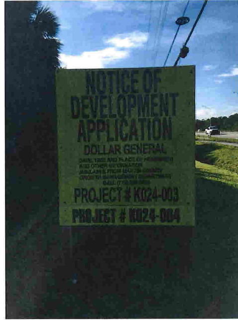
US HWY Facing North