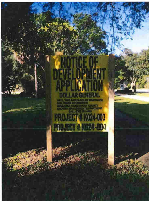
Constitution Blvd Facing East