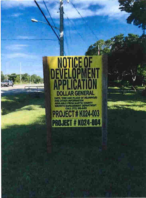
US HWY Facing South