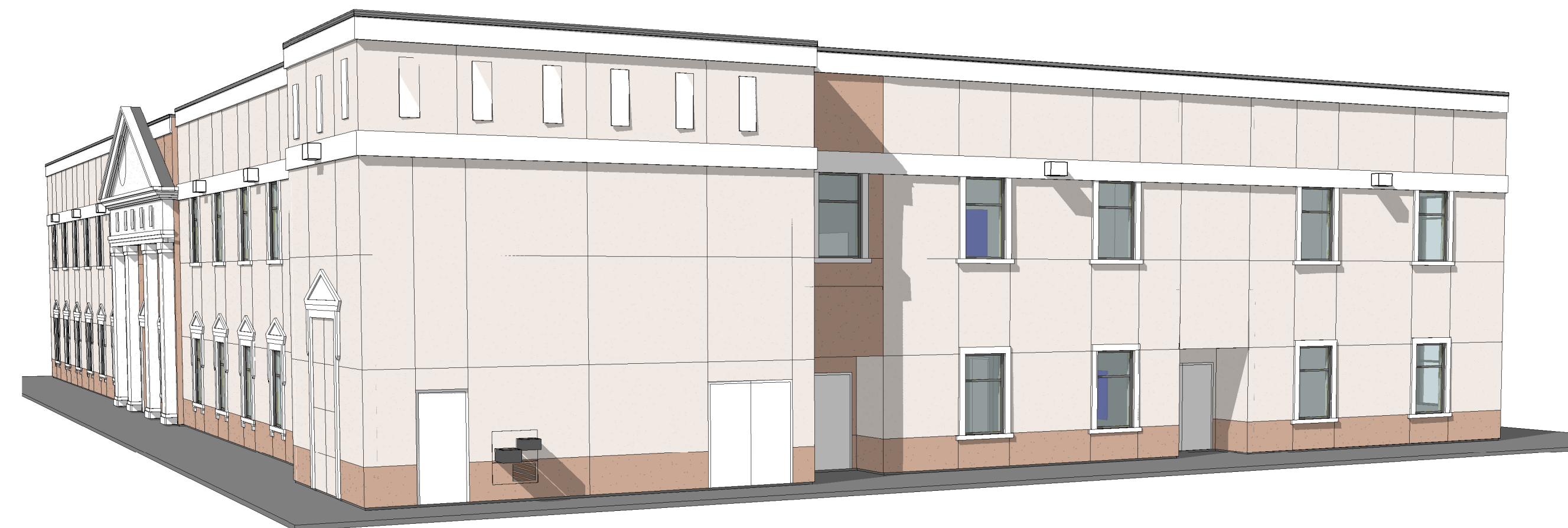
4 WEST PERSPECTIVE