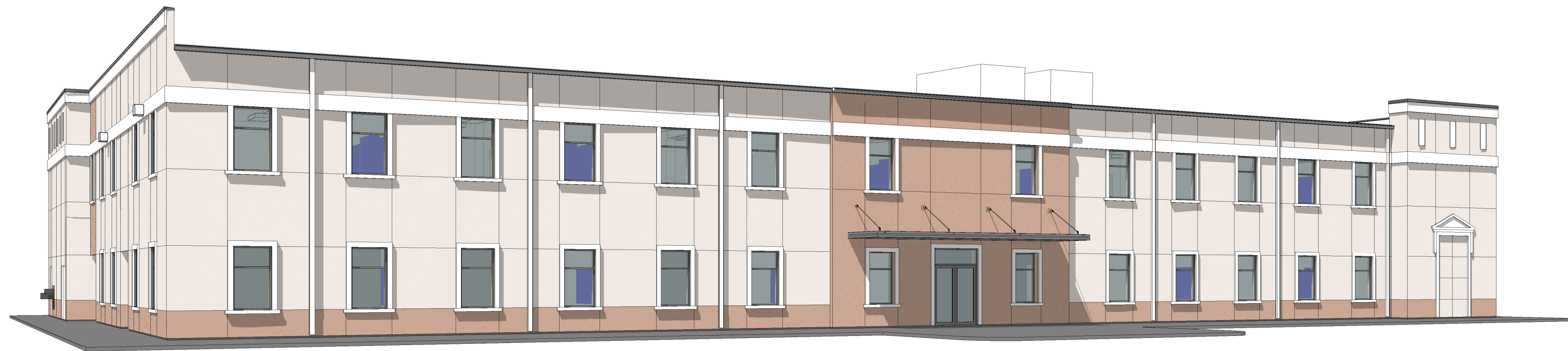
3 SOUTH PERSPECTIVE