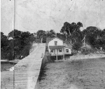
Captain Sewall's home (built 1889)