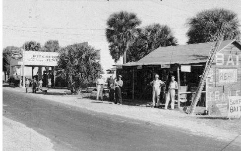
Jensen street scene (circa 1940)