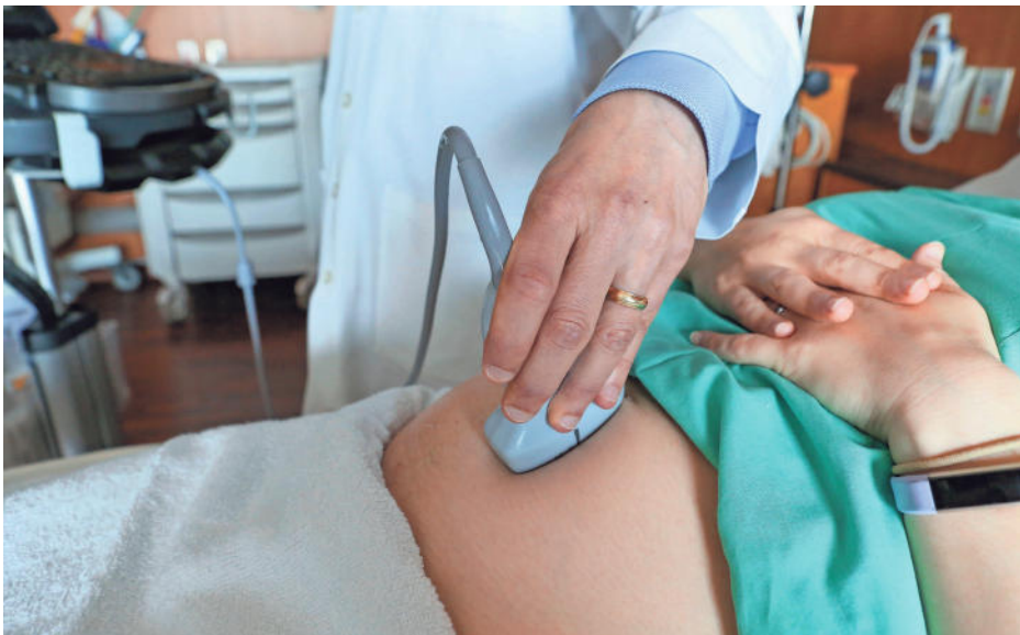
A new study suggests when a pregnant woman breathes in air pollution, it can travel to the placenta that guards her fetus.