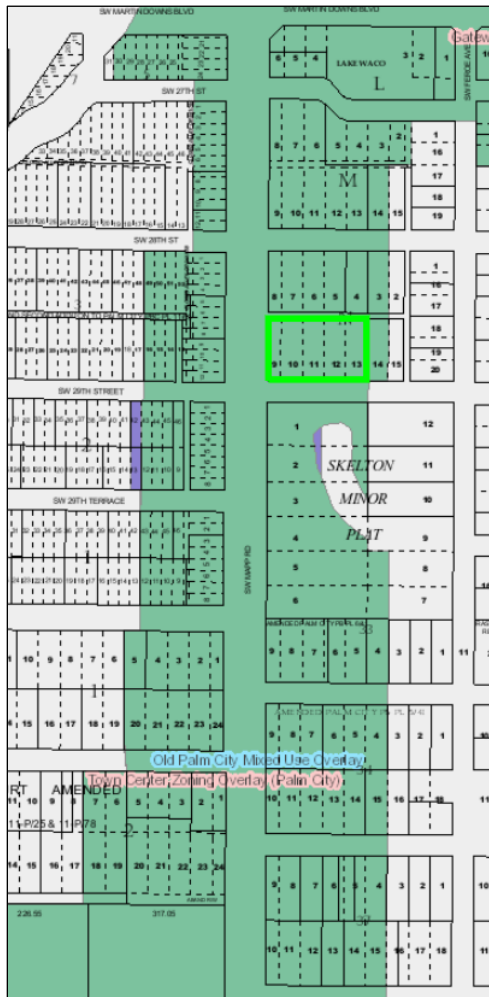
Fig. 3. Mixed-Use Future Land Use Overlay (Future Land Use Map)