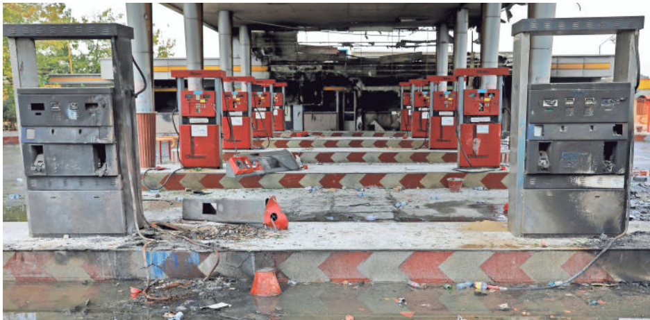
Rainwater pools at a gas station that was attacked during protests over government-set gasoline prices in Tehran, Iran.