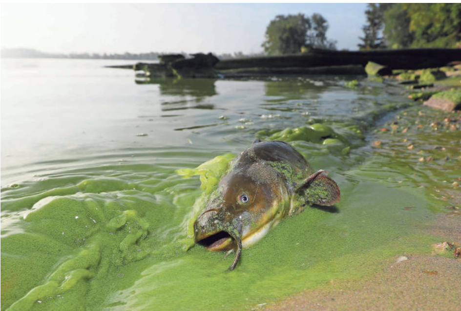
Ohio is beginning a new strategy to save Lake Erie from toxic algae. In February, the state will start offering financial incentives to farmers whose runoff feeds the algae.

Backers of the state's plan worry that farmers could get discouraged and lawmakers may back away from committing more money if algae blooms continue to overwhelm the lake.