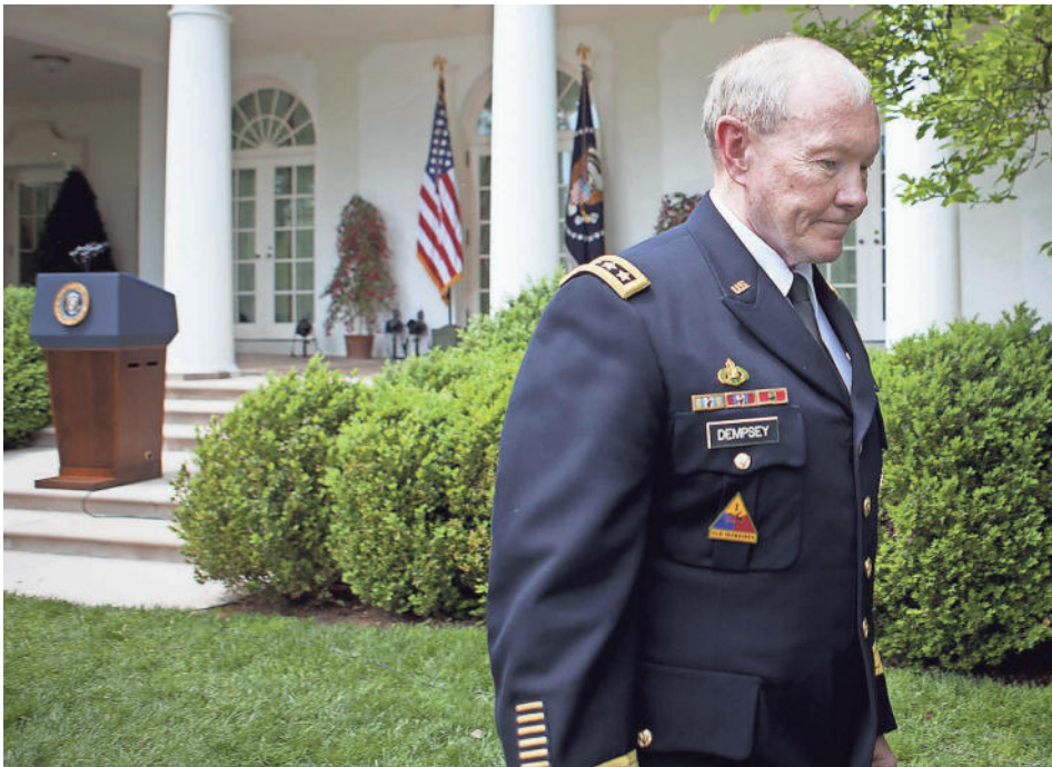
Joint Chiefs Chairman Gen. Martin Dempsey leaves the Rose Garden of the White House in 2015.