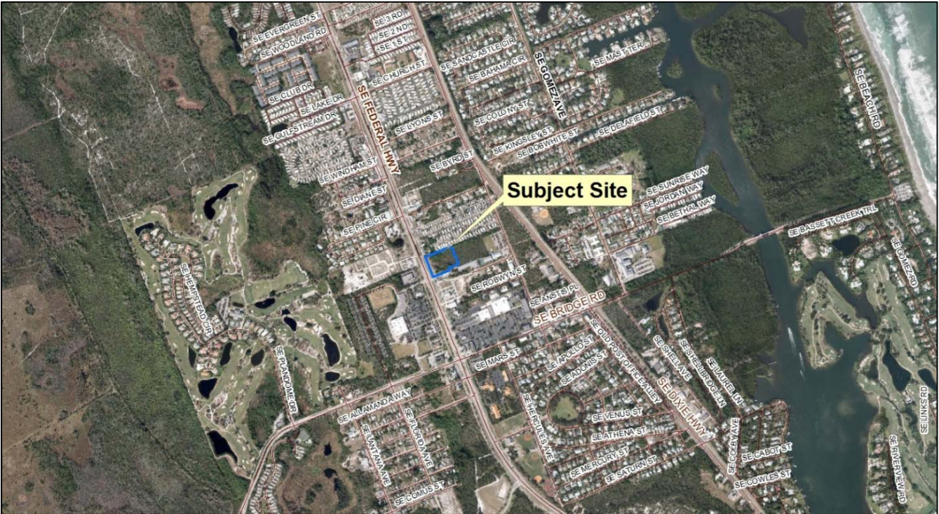
Figure 2: Subject Site 2019