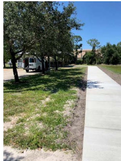
West of Pavilion Secondary Site