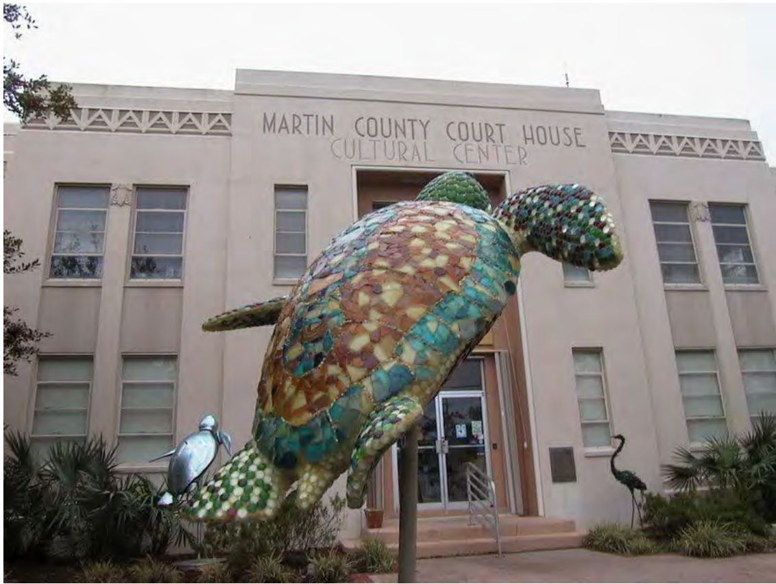
"Mosaic Memory" from the "Turtles On Parade" Event 30"H x 16"W x 36"L Fiberglas, Polymer Resin, Glass, Metal