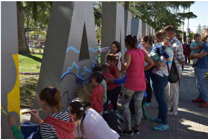
Examples of Community Painting & Interaction Opportunities