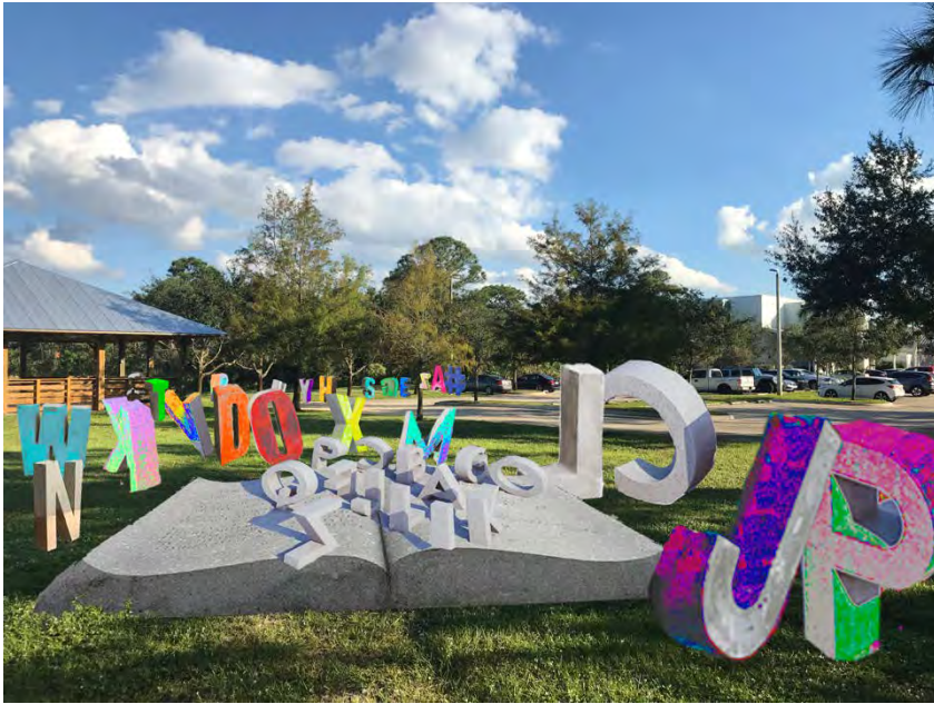
"FROM A-Z" 3'H x varying 3"W x 12"D Concrete, Paint