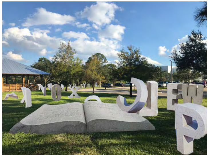
Example of Unfinished Concrete