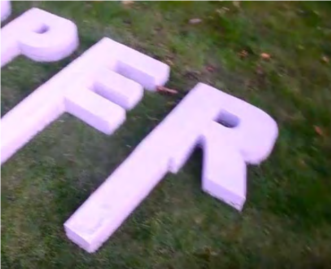
Example of Concrete Anchor Footing