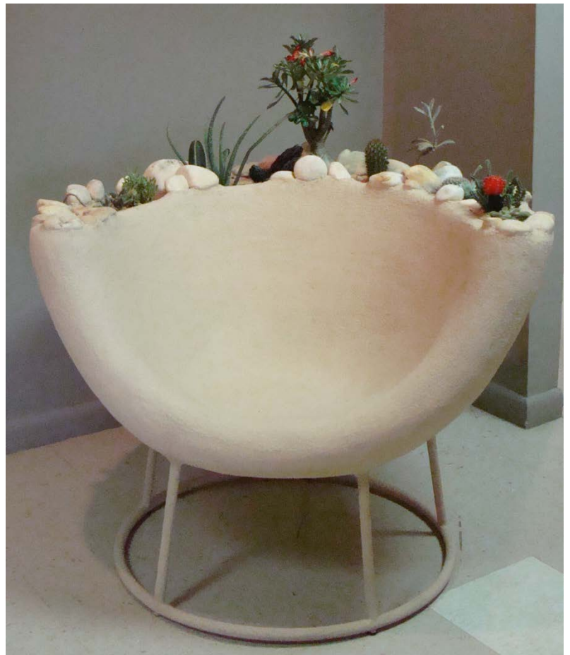
"DESERT FOR ONE" from the "Eco-Chair" Series 4'H x 4'W x 4'D Polymer Modified Cement over EPS Foam Stone, Metal, Living Plants