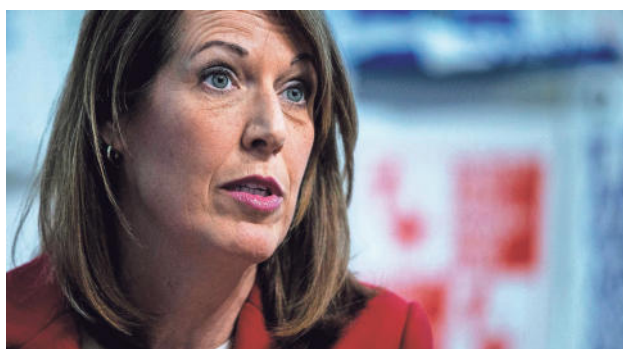
U.S. Rep. Cindy Axne, D-Iowa, hopes to hold her House seat in a race against Republican former Rep. David Young, whom she ousted in 2018.

In early spring, Rep. Cindy Axne, D-Iowa, called around to small businesses in her district eager to hear how they were coping as the pan-