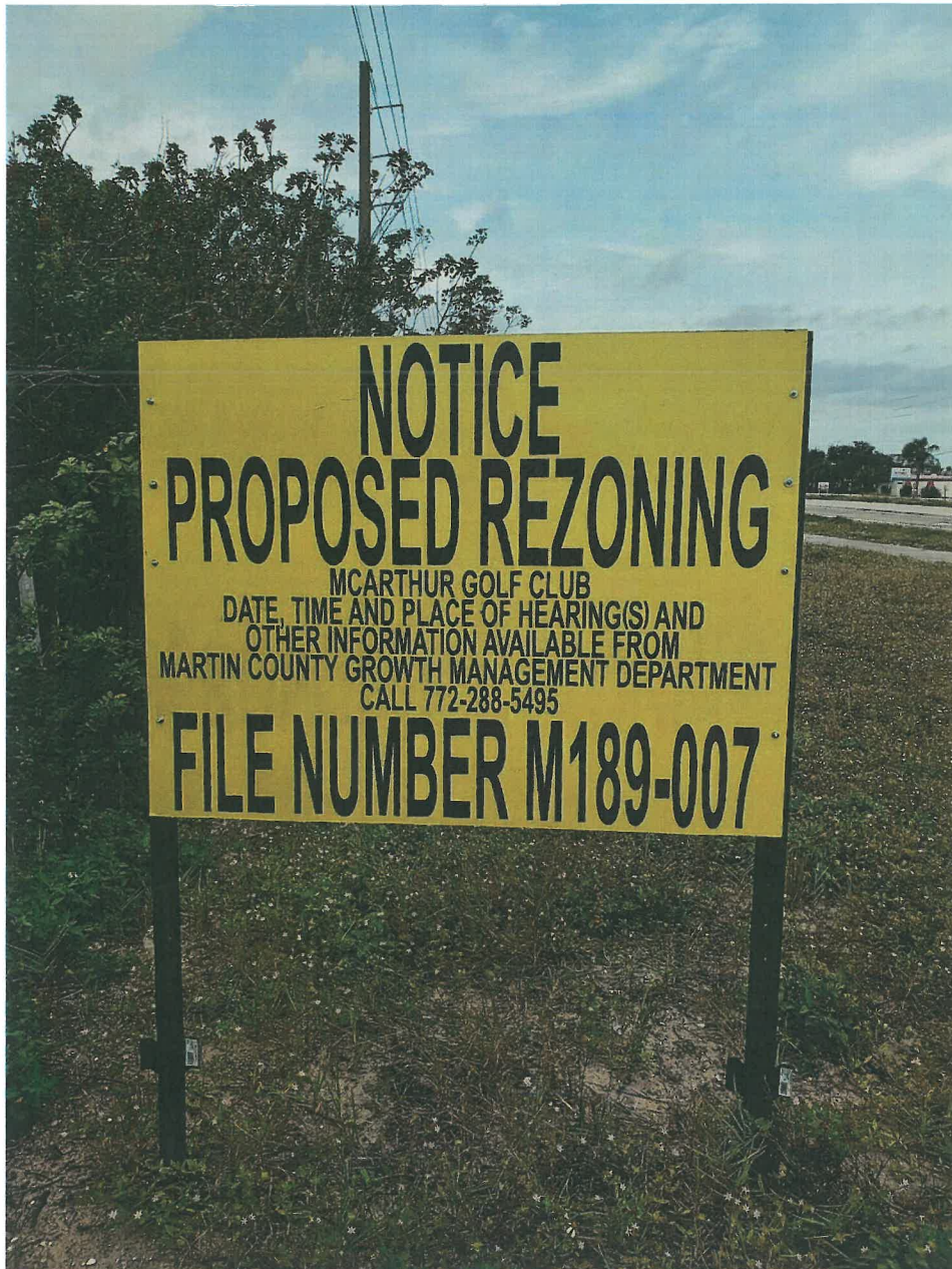
Side Two Sign Photograph