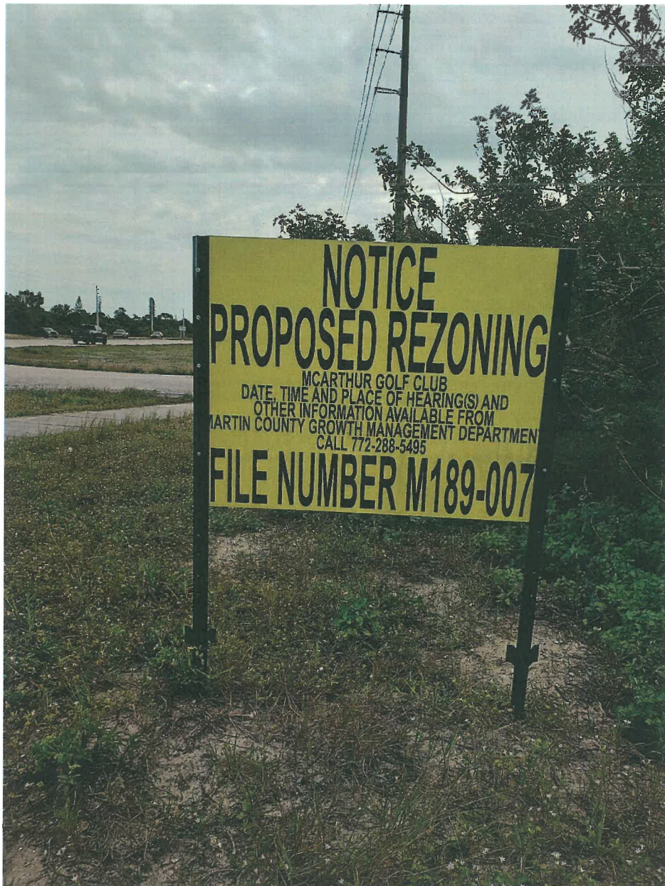
Side One Sign Photograph