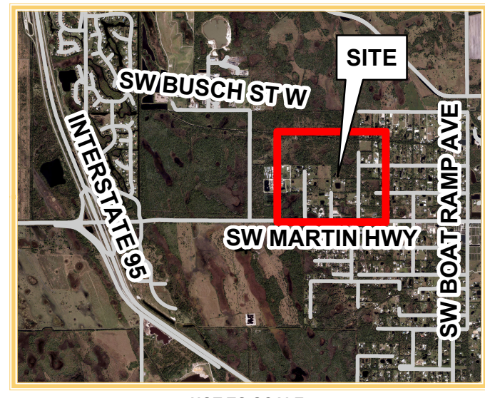
NOT TO SCALE 2021 AERIAL