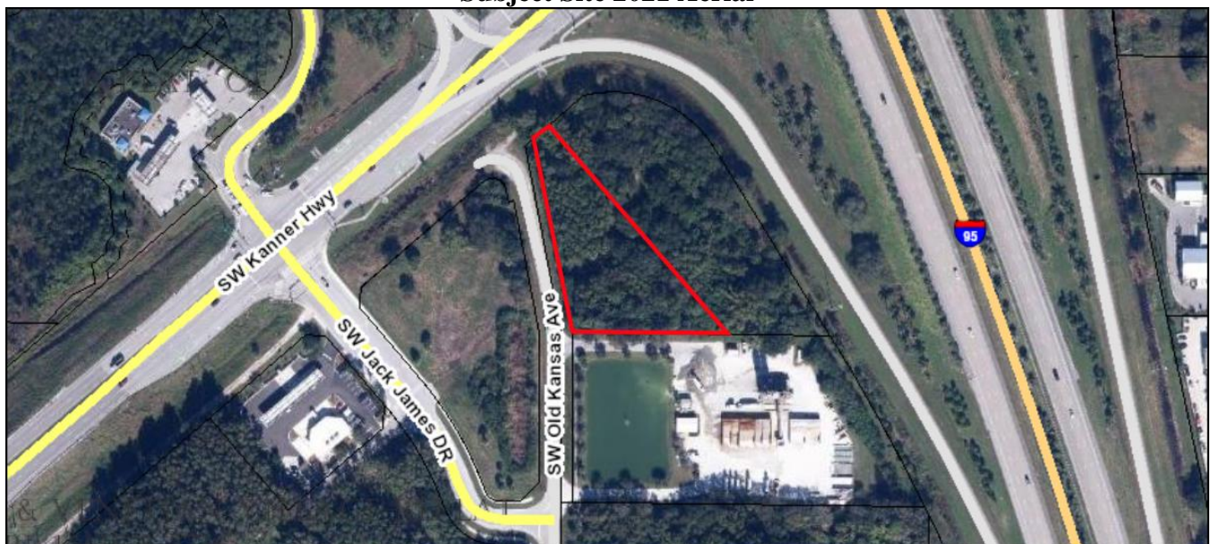
Subject Site 2021 Aerial

To the north: I-95 Interchange off ramp (across SW Kanner Hwy) To the south: Existing Concrete Batch Plant To the east: I-95 ROW To the west: Vacant Industrial