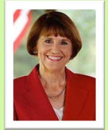
Senator Gayle Harrell District 25