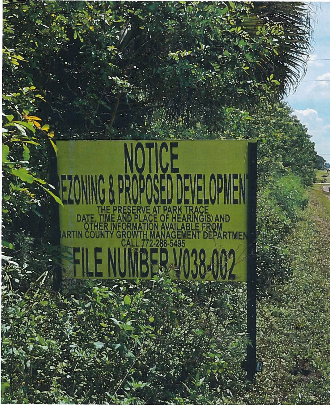
Sign 1- Side 2