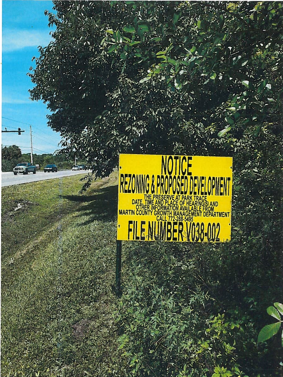
Sign 1- Side 1