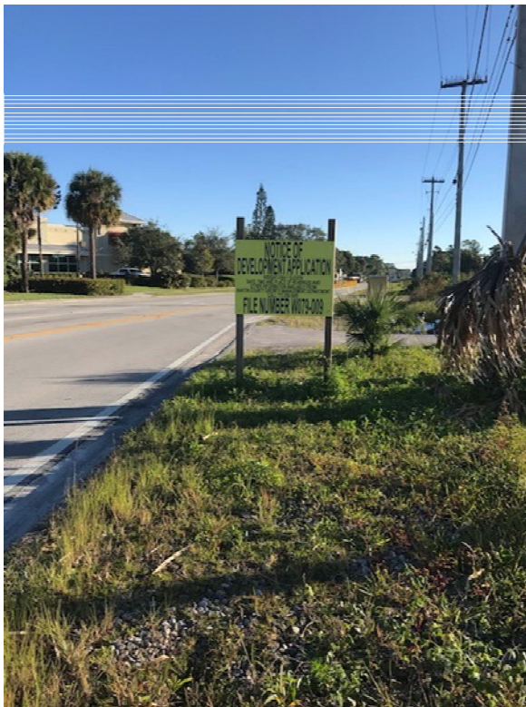
Salerno Rd Looking East