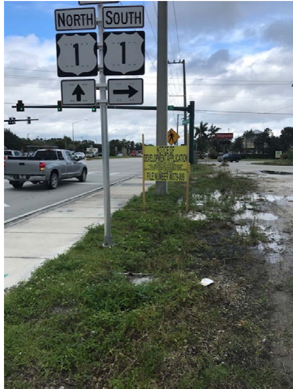
Kanner Highway Looking South