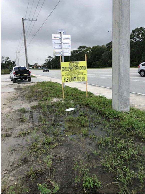
Kanner Highway Looking North