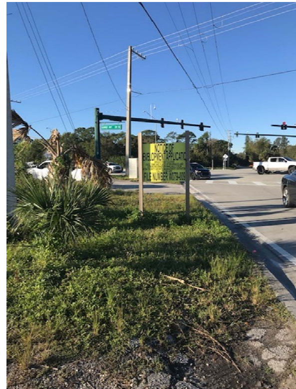
Salerno Rd Looking West